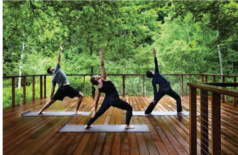
1 FLEXIBLE POOL DECK