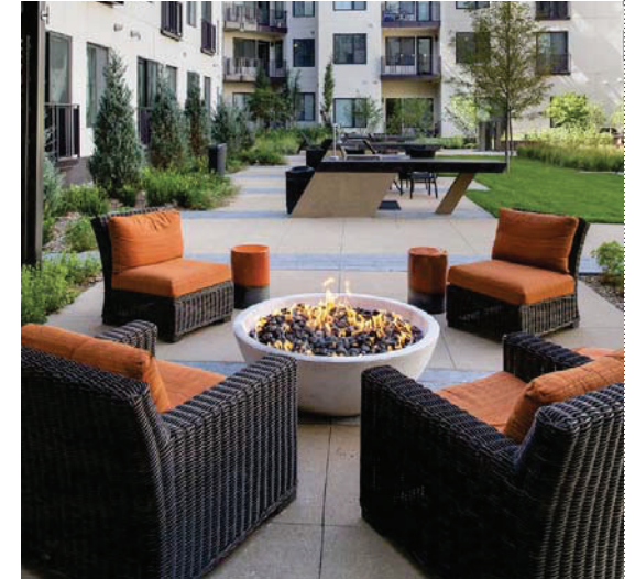
2 DURABLE / CONTEMPORARY LOUNGE CHAIRS