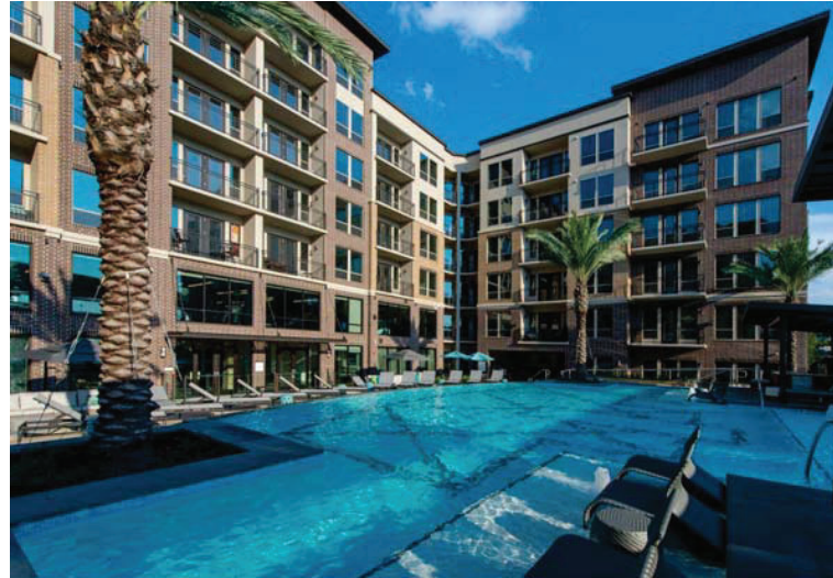
① LIFTED EDGE POOL/ACCESSIBILITY