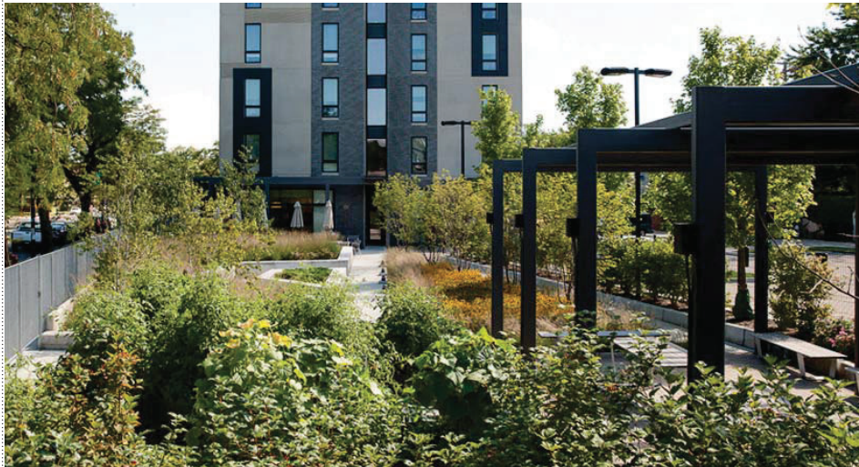
3 INDOOR OUTDOOR CONNECTIONS PHYSICAL AND VISUAL