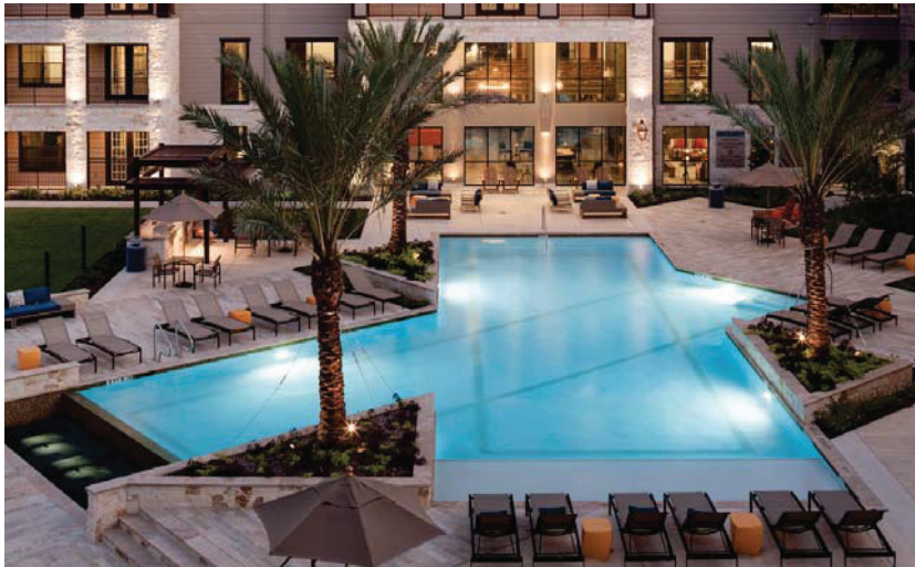
③ ACCENT MOVEABLE FURNITURE TO BRIGHTEN AND EXCITE