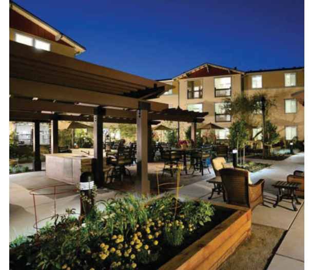
② SHADE STRUCTURE DEFINE OUTDOOR ROOMS