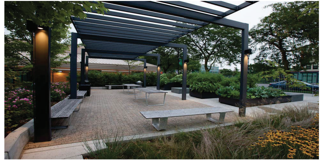
4 OUTDOOR COLLABORATION ZONE