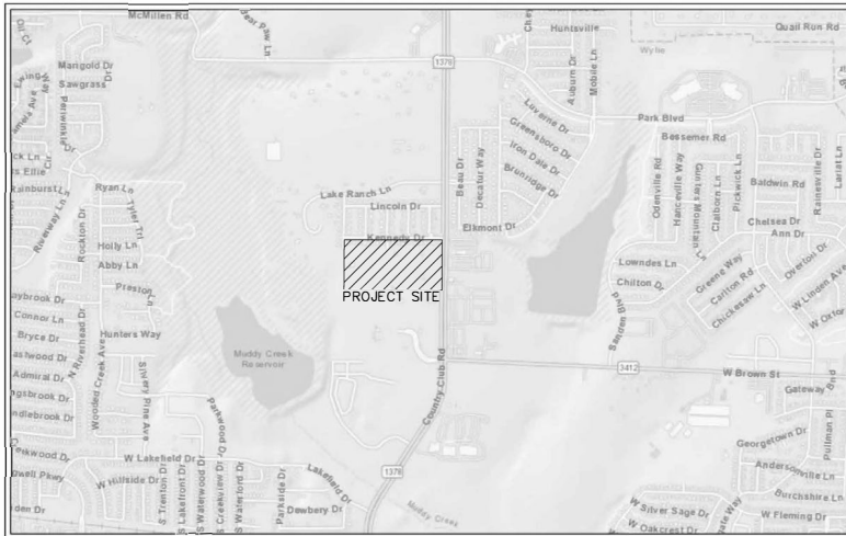
VICINITY MAP N.T.S.