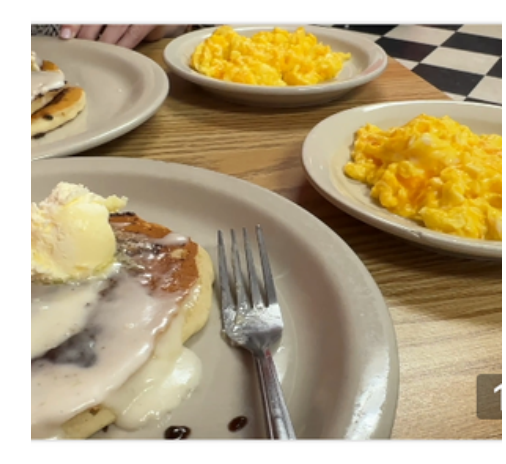
over to check out Country afe in Wylie, Texas! After...