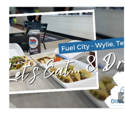
3 WHAT?! Fuel City let us be enes yesterday at their new