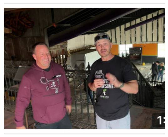
ity! Here it is! Creekside Fine in Wylie Texas in no time! I v