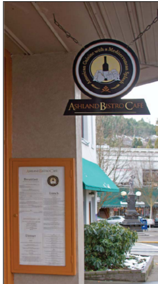
Figure 6-3 Exempt Incidental Signs