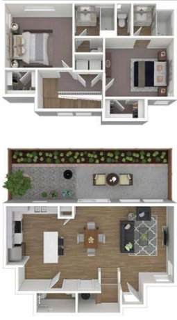
2 Story 2 Bed - 2.5 Bath 1,223 sq. ft.