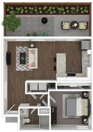
1 Story Duplex 1 Bed - 1 Bath 633 sq. ft.