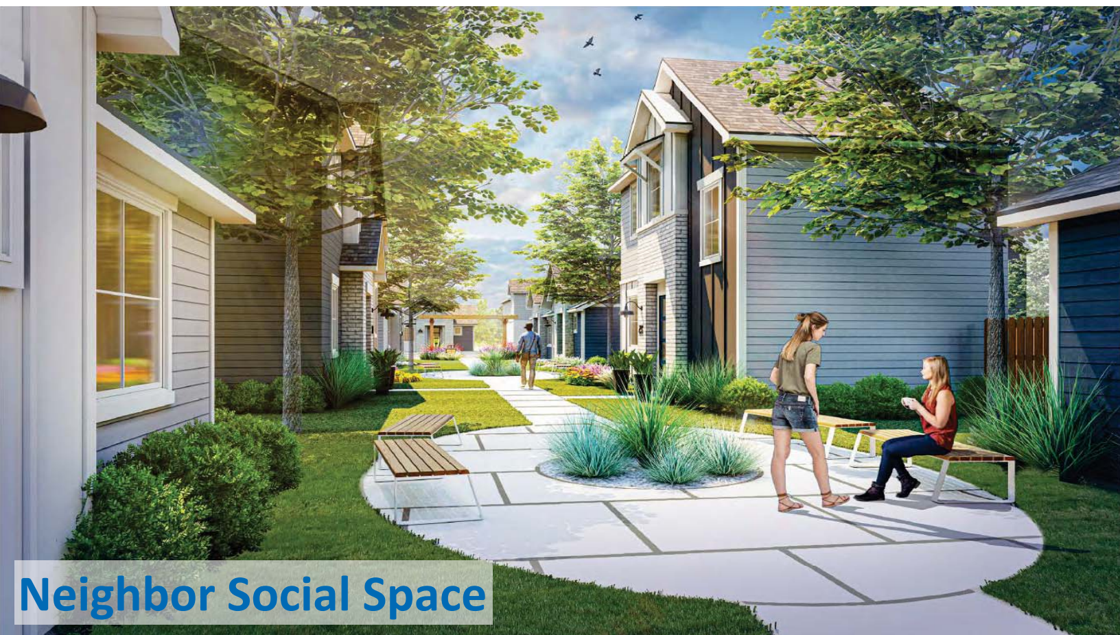
Neighbor Social Space