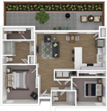
1 Story 2 Bed - 2 Bath 971 sq. ft.