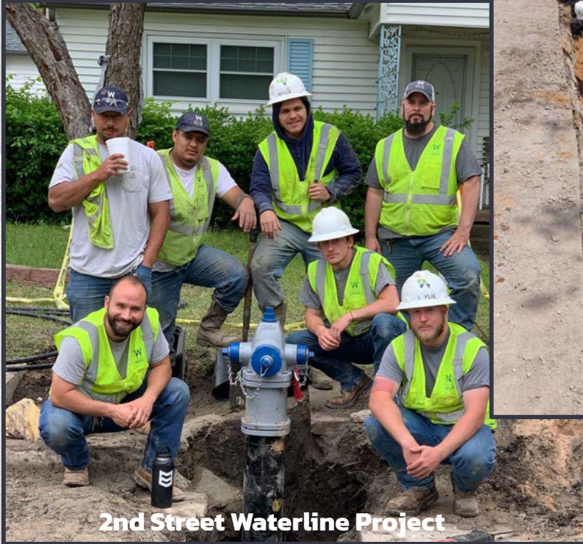
2nd Street Waterline Project