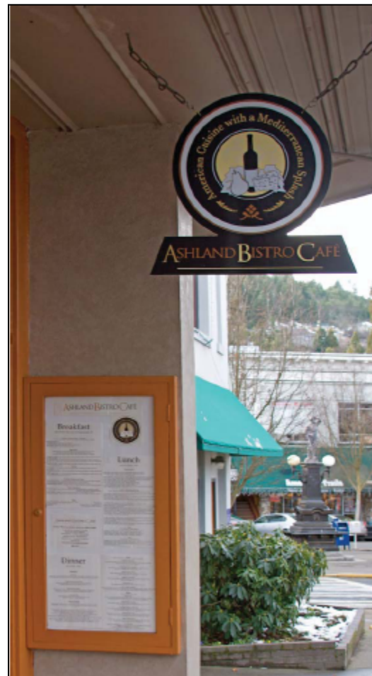
Figure 6-3 Exempt Incidental Signs