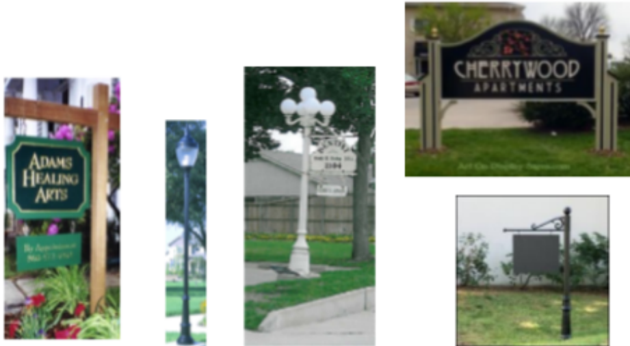
Figure 6-2 Typical Pole Sign Features for Residential Structures