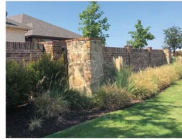
6'-0" HT. MASONRY SCREENING WALL WITH COLUMNS EXAMPLE PHOTOS