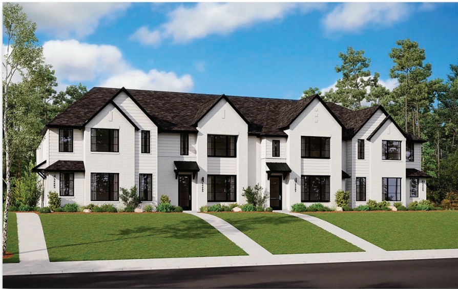
TYPE 2 HOMES