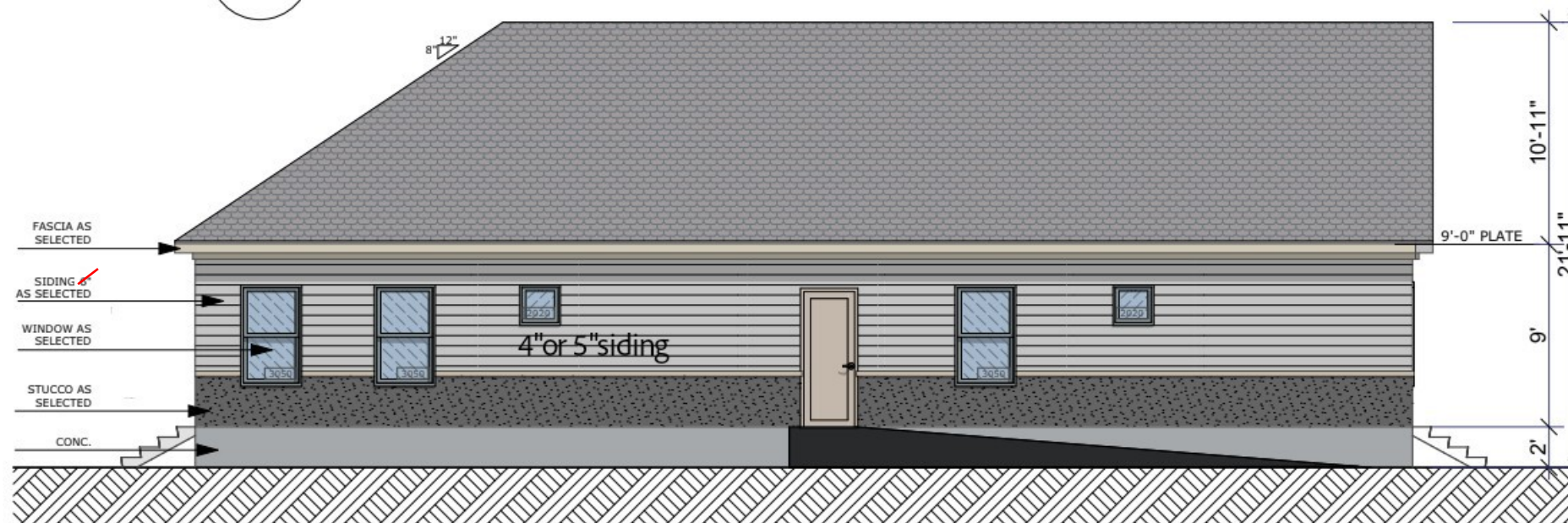
2 LEFT ELEVATION SCALE: 1/8" = 1'-0"