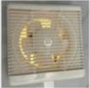
Extractor Shutter Fan