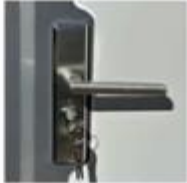
Security Door Lock