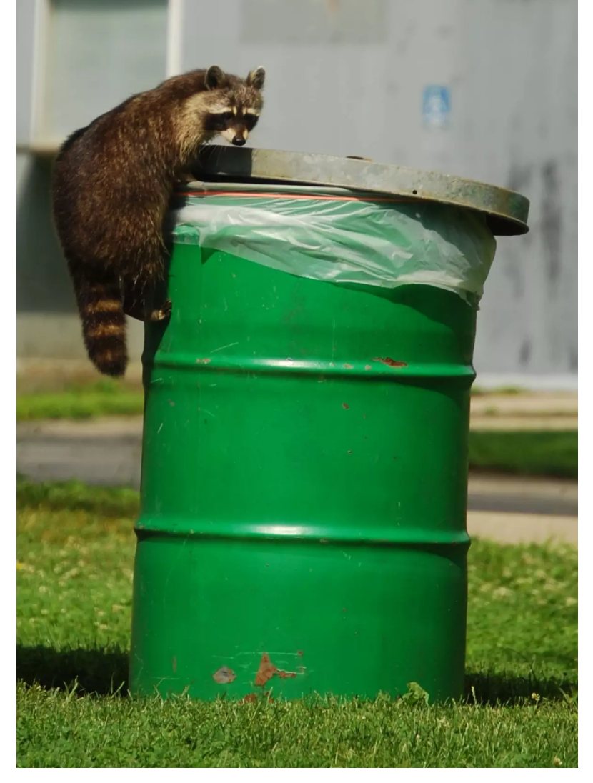
An animal sneaking into your trash can or an unsecured trash bin at a wildlife refuge might lead to an accidental feeding. | Image Details

An intentional feeding is when an animal gains access to food because of direct human interaction. This type of feeding might include leaving food out for an animal in your backyard or encouraging an animal to eat out of your hand.