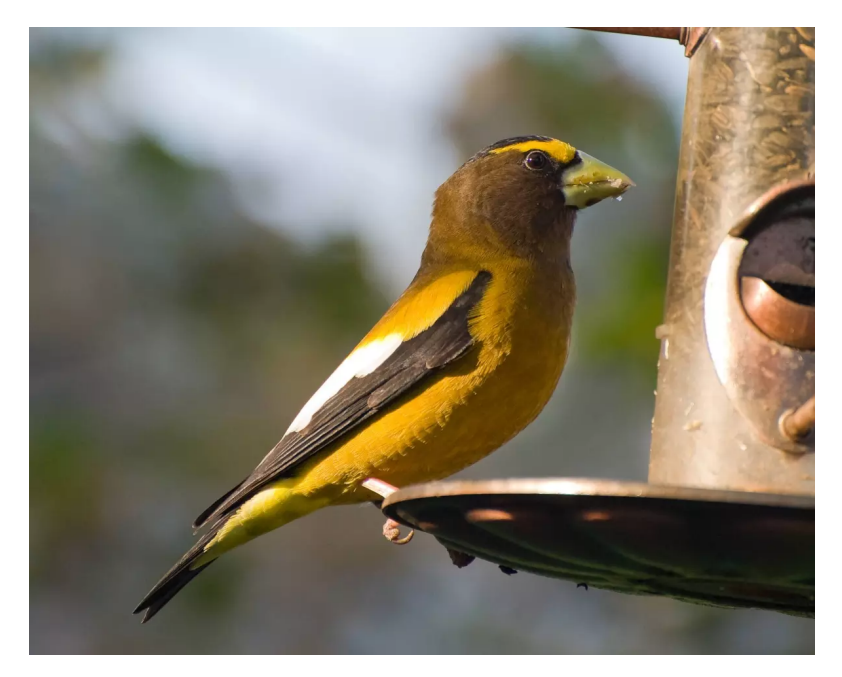
An evening grosbeak perches at a bird feeder. | Image Details

feeders from turning into buffets for other non-avian wildlife. You can read more <u>here</u> about how to keep your birdfeeders safe for your local avian friends, or check out Dragon's <u>video about bird feeding basics</u> .