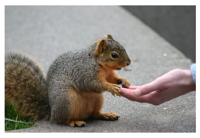
Hand feeding or leaving food out for a wild animal would be intentional feeding. | Image Details

An intentional feeding is when an animal gains access to food because of direct human interaction. This type of feeding might include leaving food out for an animal in your backyard or encouraging an animal to eat out of your hand.