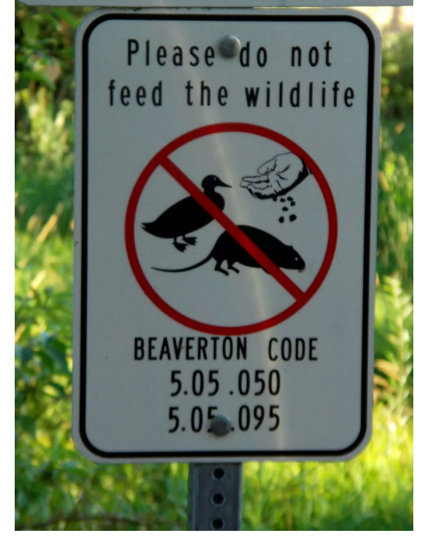
A sign at Tualatin River National Wildlife Refuge advising visitors not to feed the wildlife. | Image Details