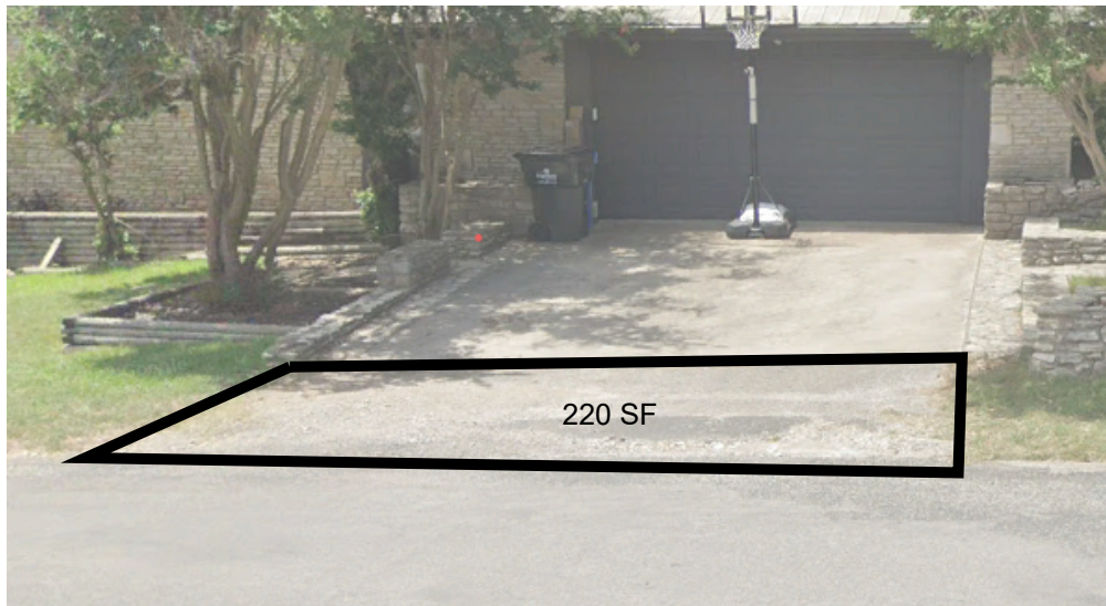
73 Augusta Drive (Brookhollow Driveway)