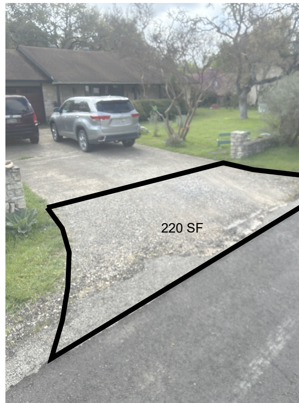
23 Shady Grove Lane