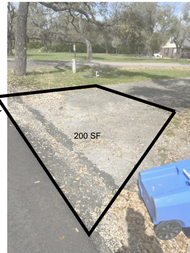
19 Brookmeadow Drive (East)