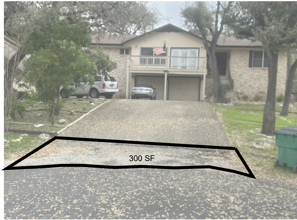
17 Tremont Trce