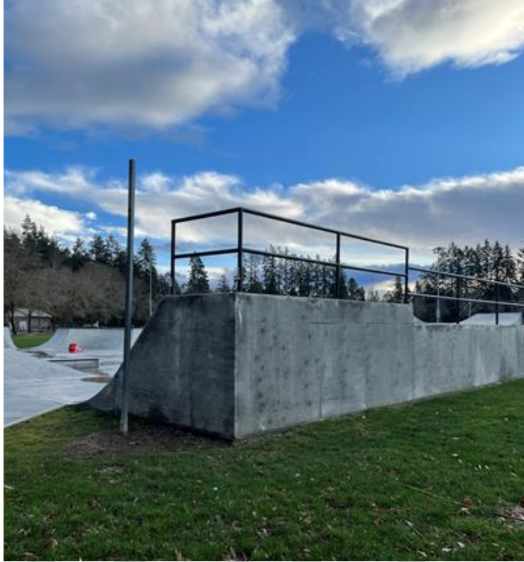
Wall 3 (side of wall 2)