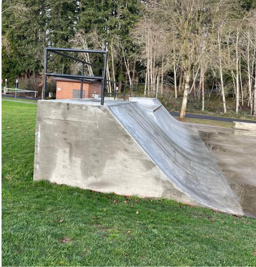
Wall 1 (side of wall 2)