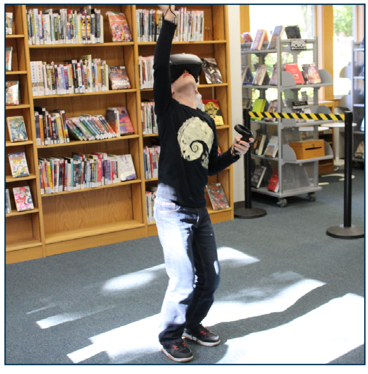
One teen experiencing Virtual Reality at the Early Release Day Teen Event on May 8.

Summer Reading Program begins June 1, with a special Kick-off Event on Saturday, June 15, from 10am-2pm, with a special performance by Cellobop at 1pm.