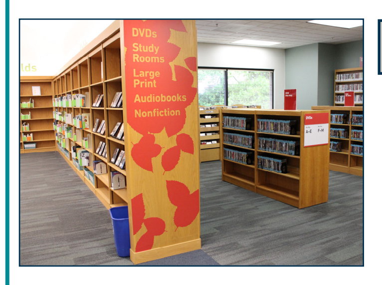
The new signage incorporates local tree leaves in the design.