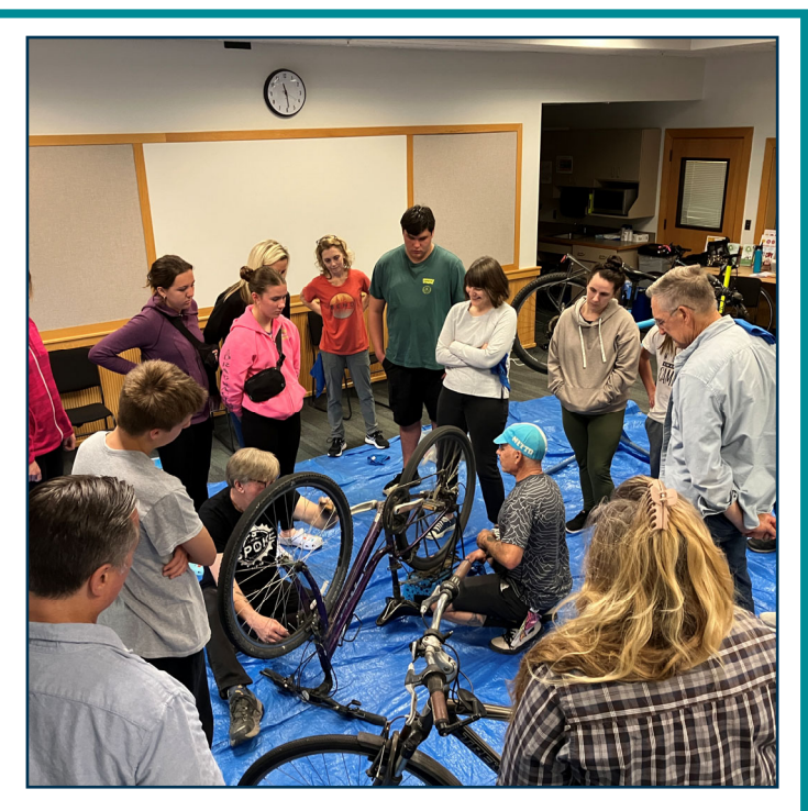
WashCo teaches basic bicycle maintenance at the Bike Repair 101 workshop on May 18.

In partnership with SMART, WashCo taught about basic bike maintenance, tools, and equipment. Participants brought their own bicycles and received hands-on instruction at this free workshop on May 18.