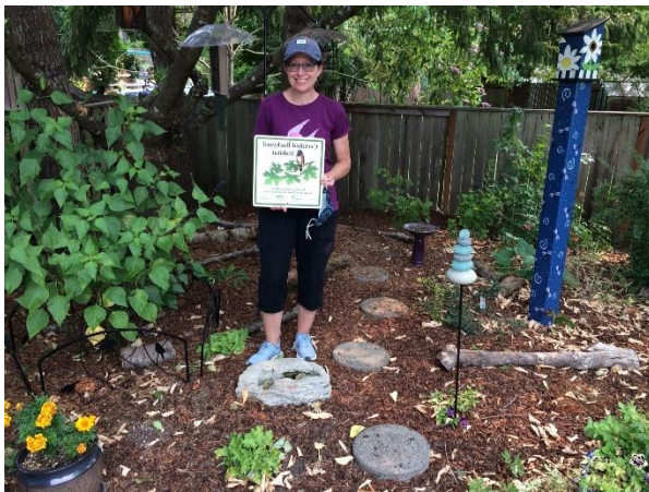
Mala – Certified in 2021