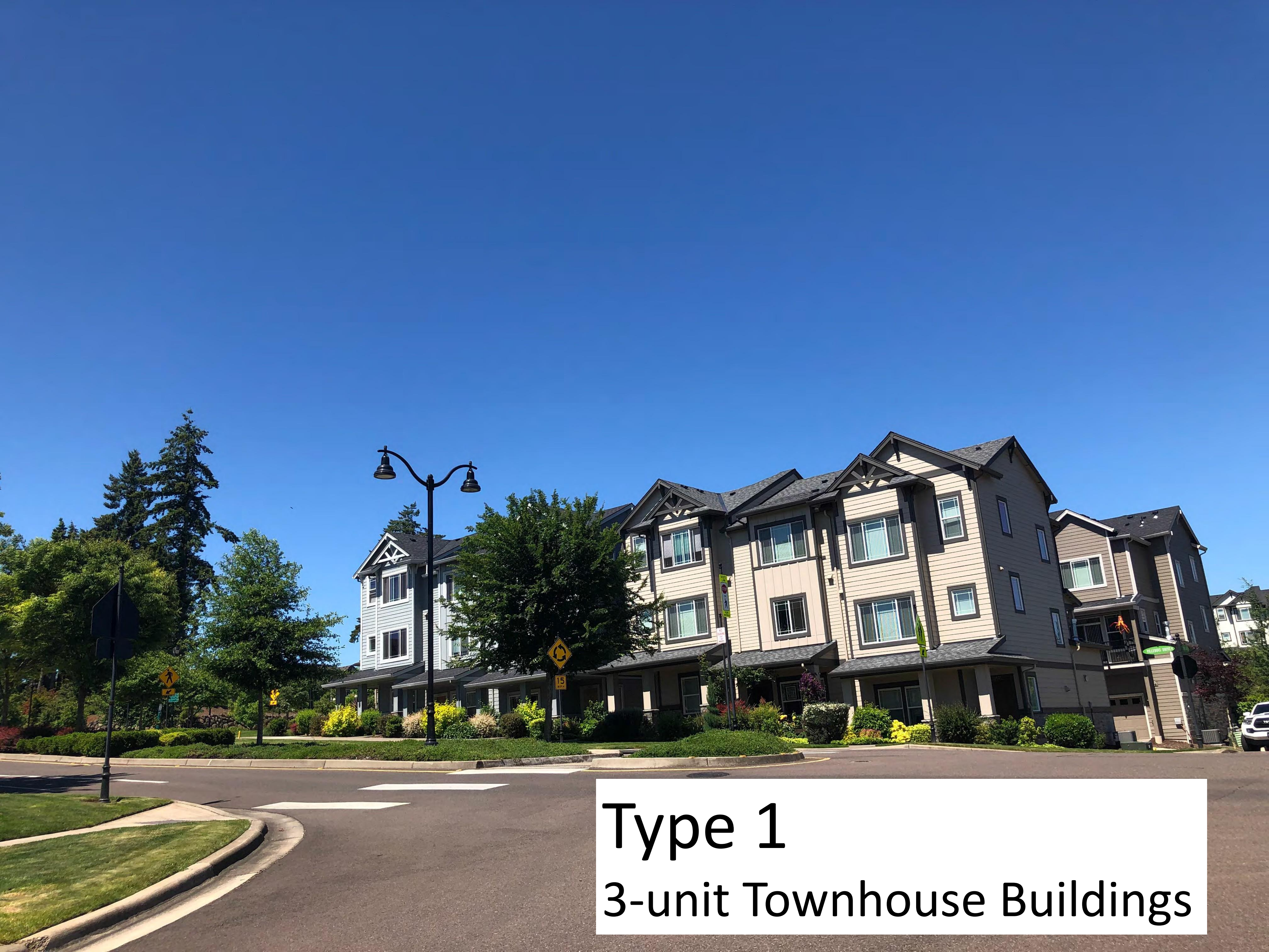
Type 1 3-unit Townhouse Buildings