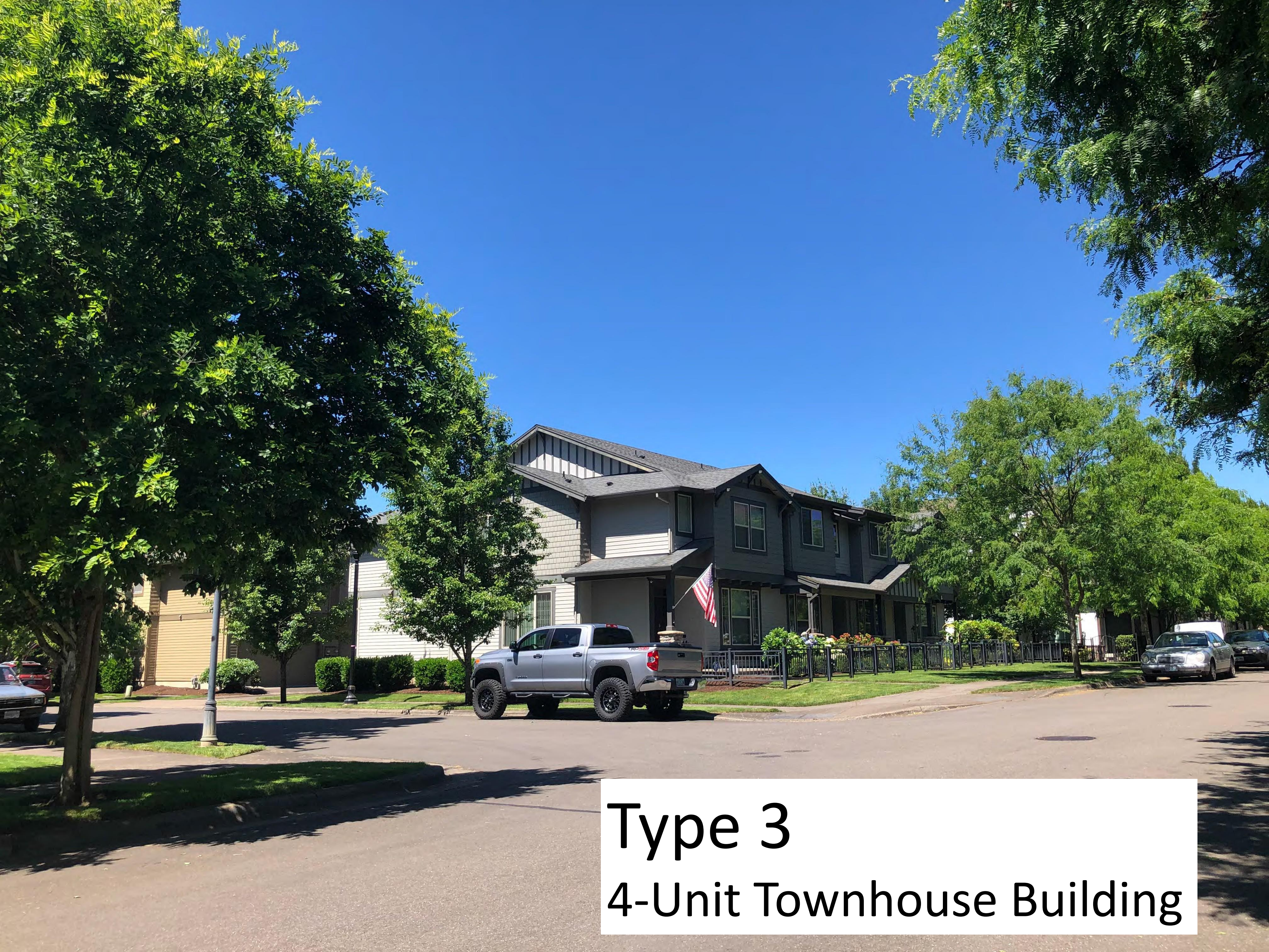
Type 3 4-Unit Townhouse Building