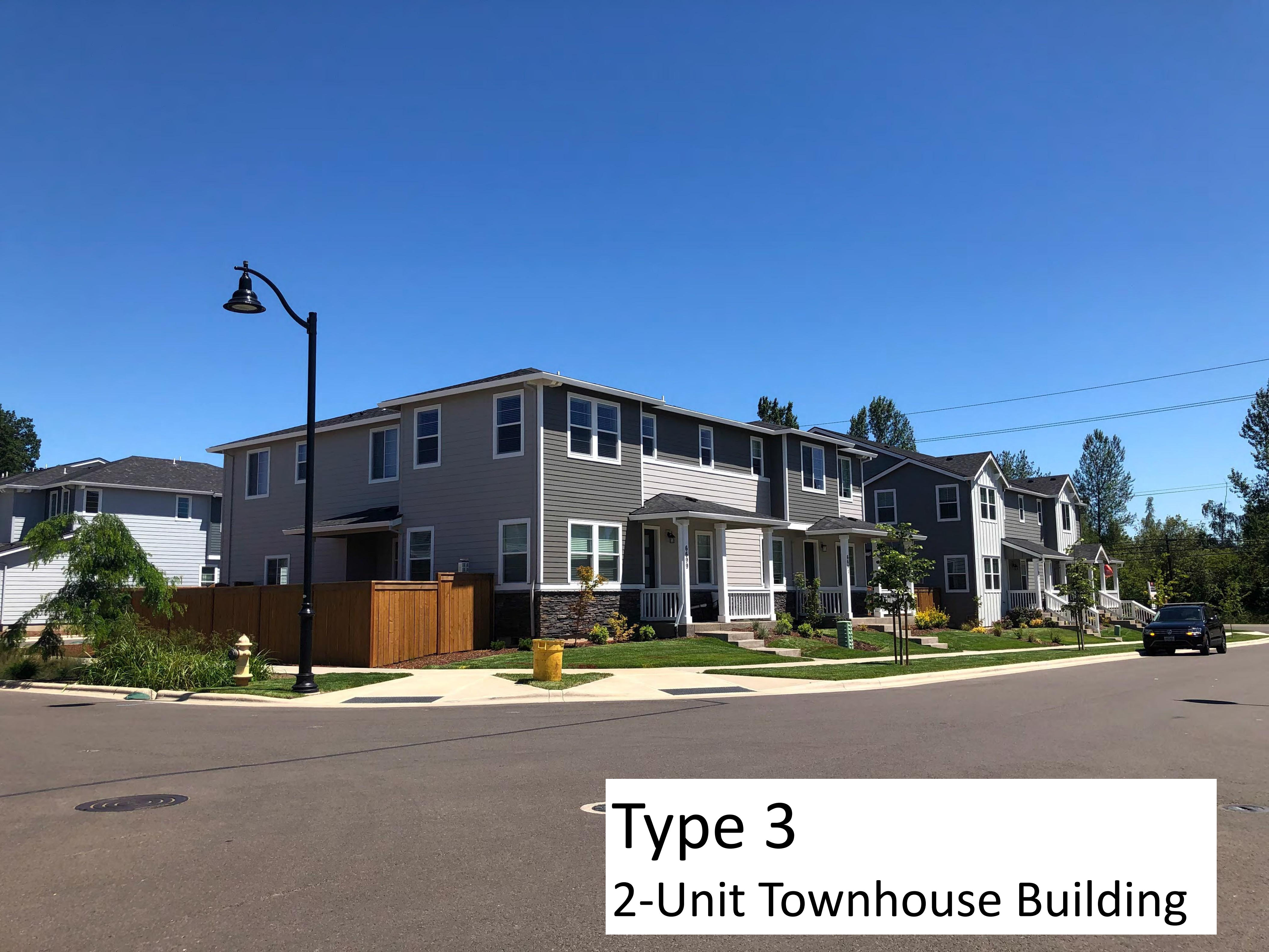
Type 3 2-Unit Townhouse Building