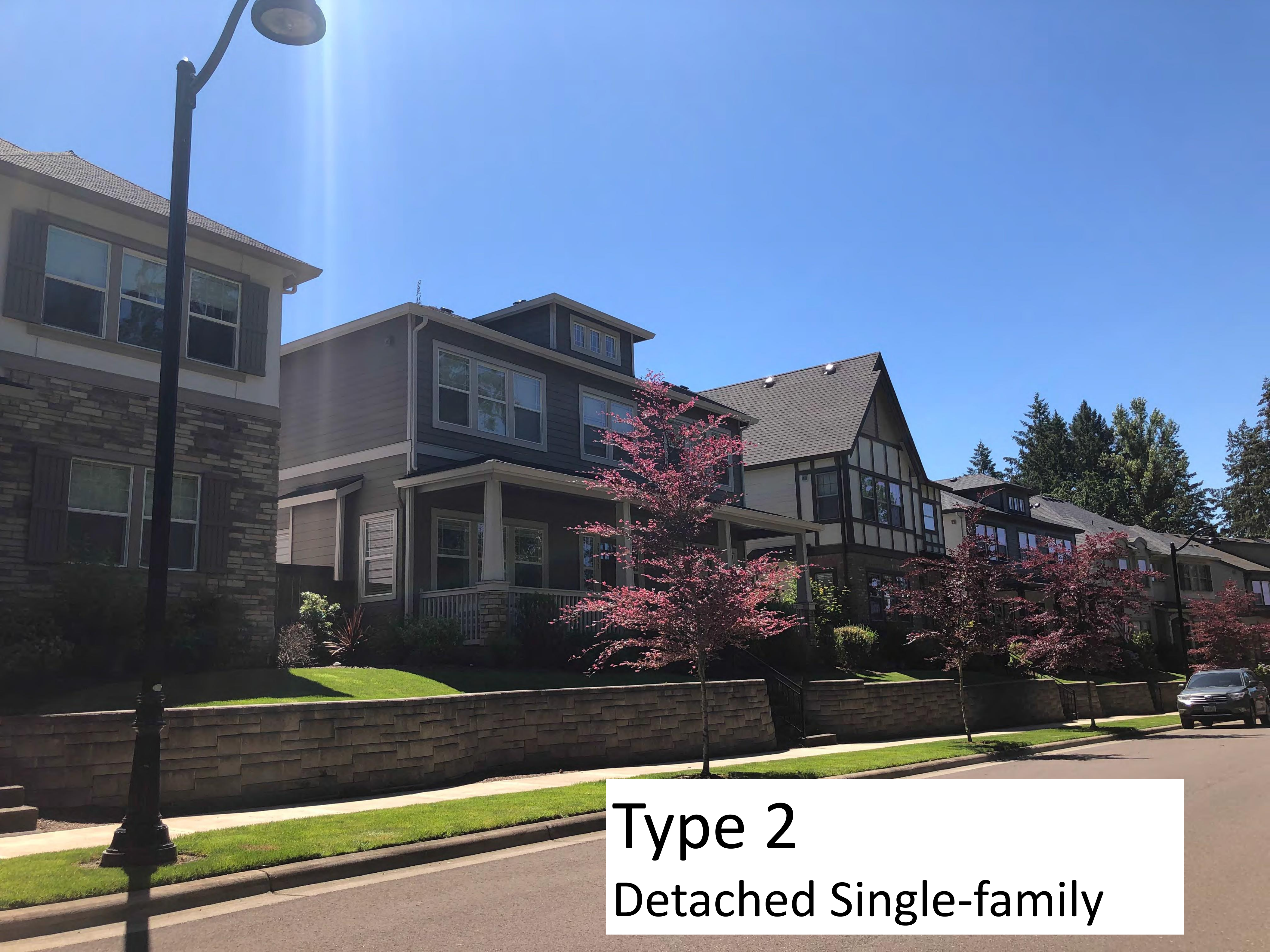
Type 2 Detached Single-family