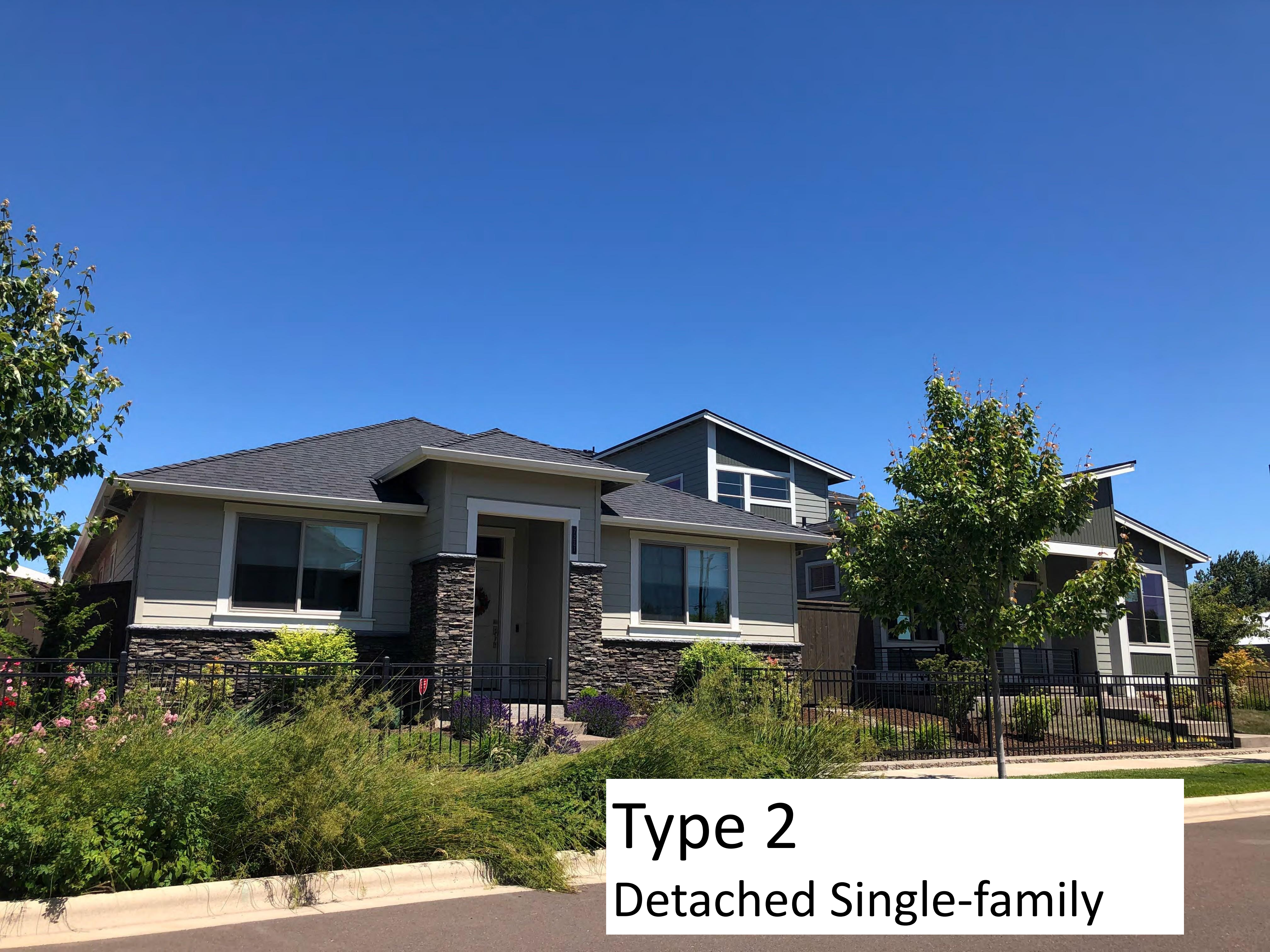
Type 2 Detached Single-family