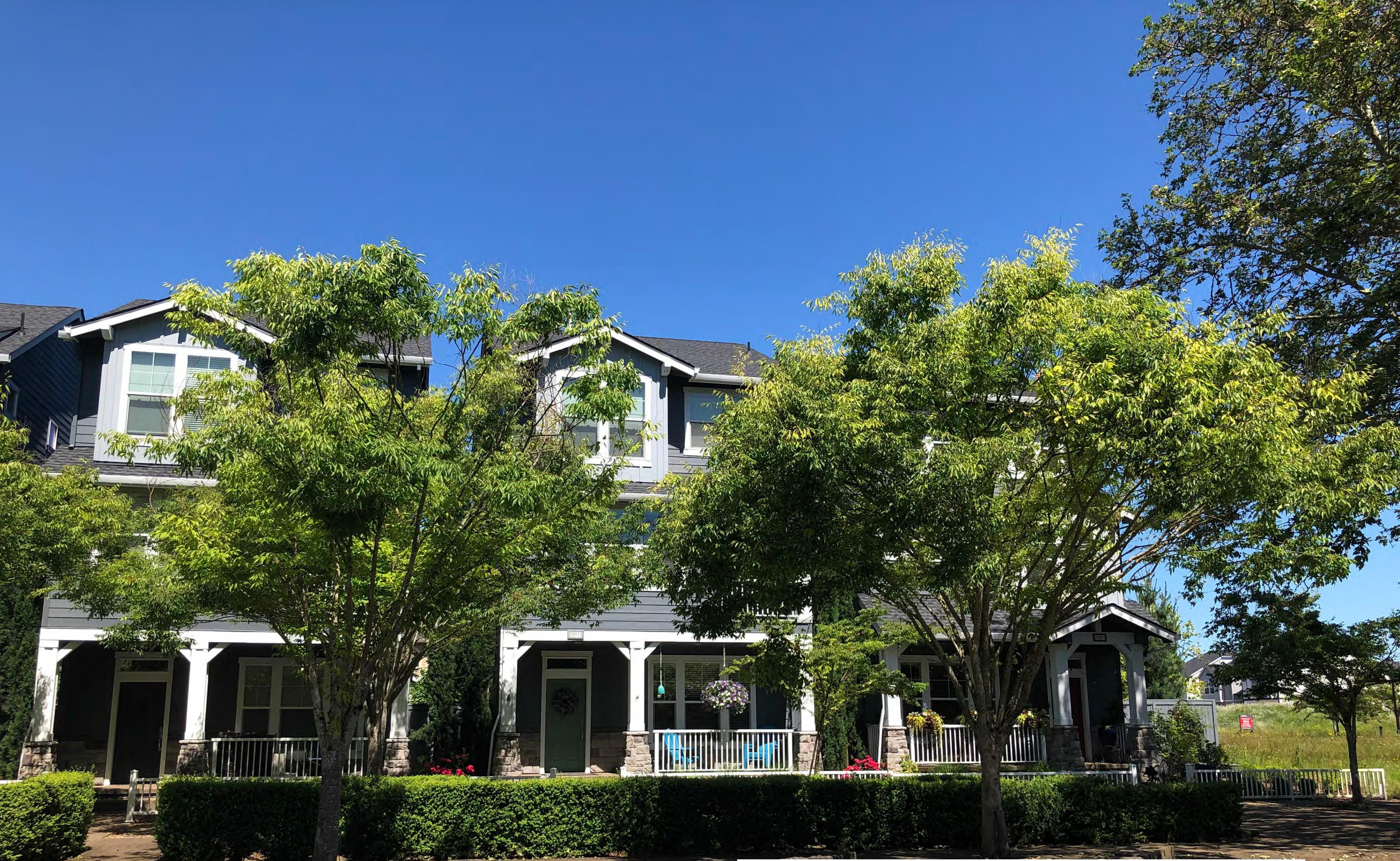
Type 1 Detached single-family