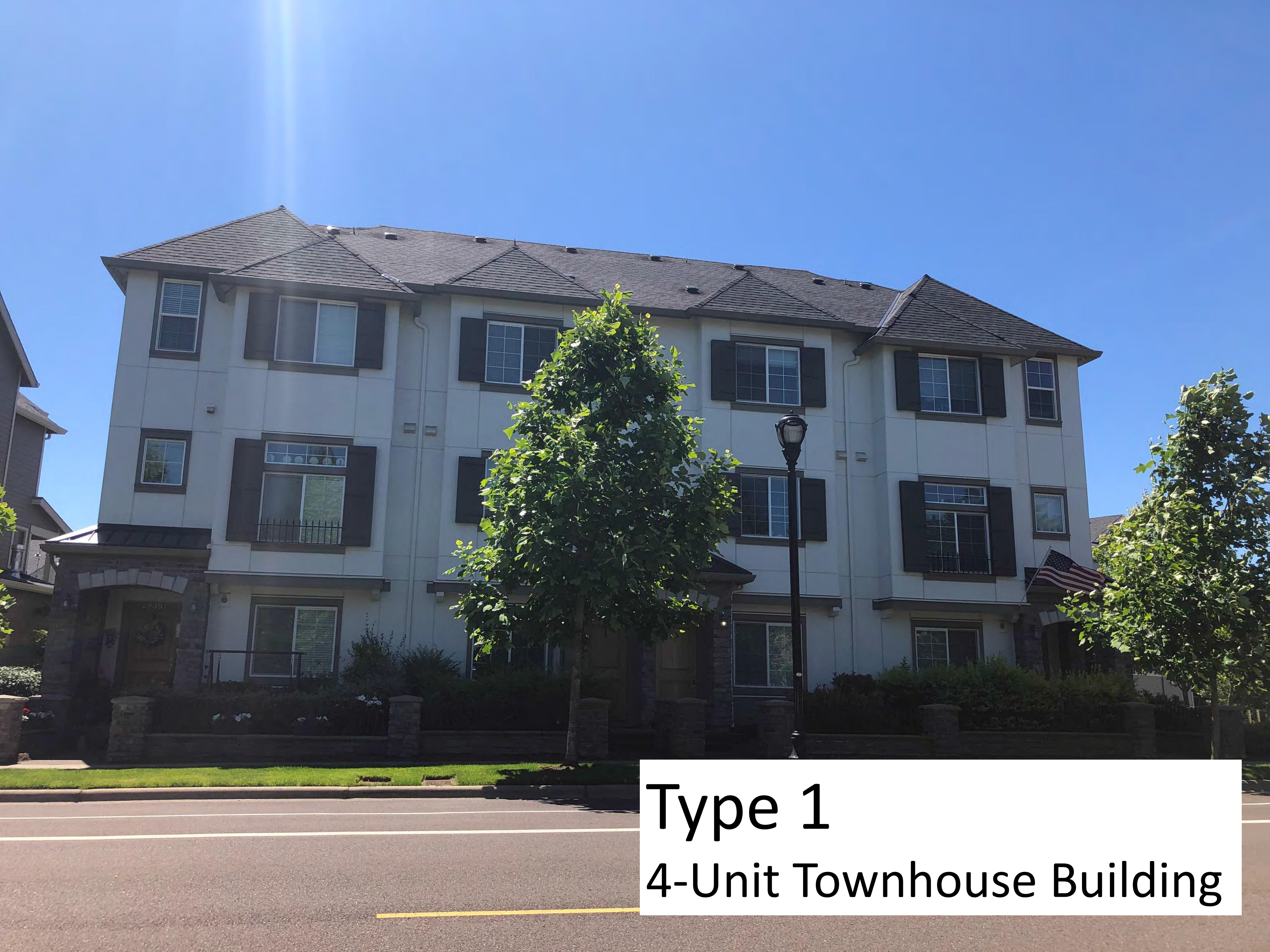
Type 1 4-Unit Townhouse Building