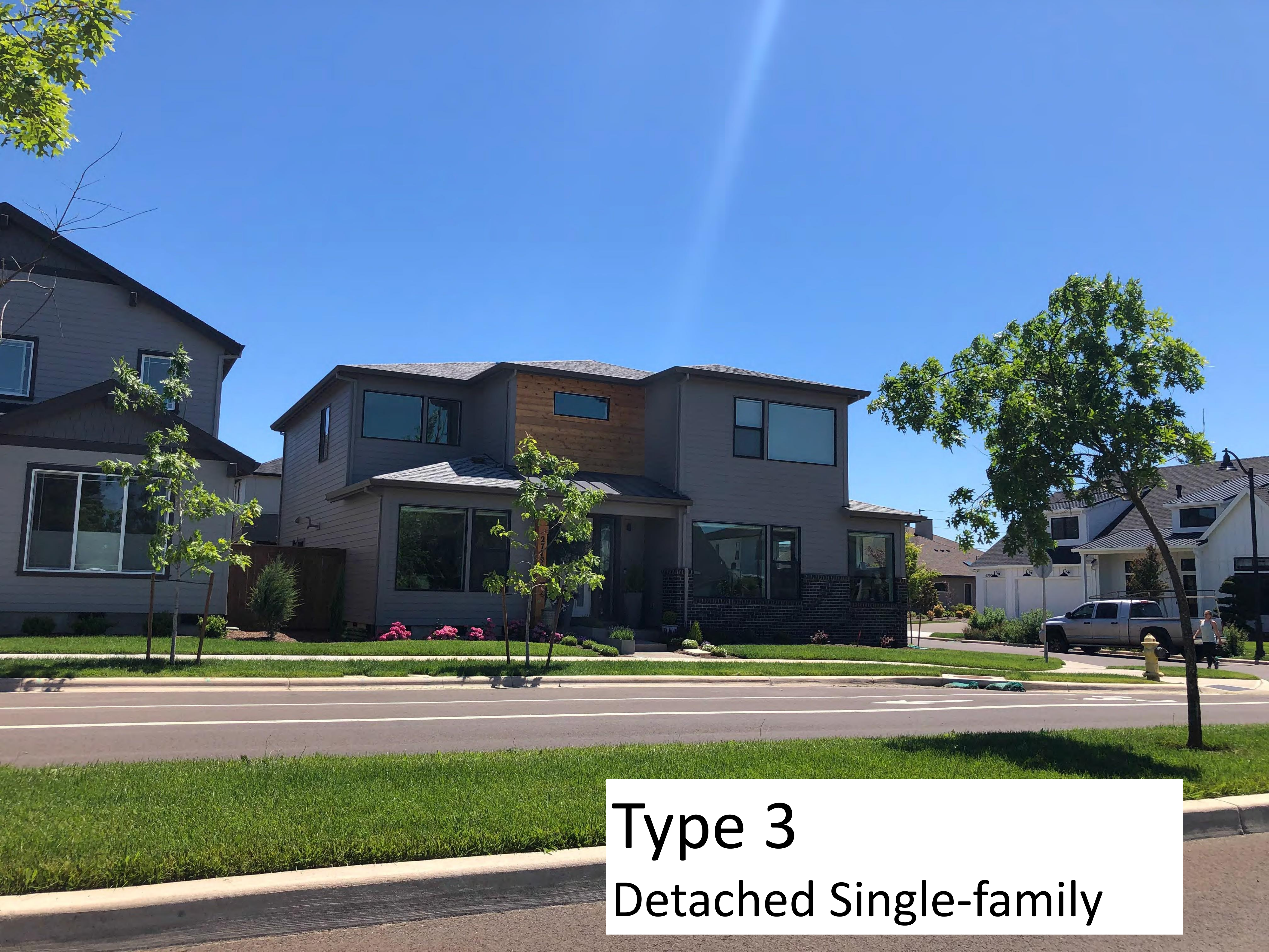
Type 3 Detached Single-family