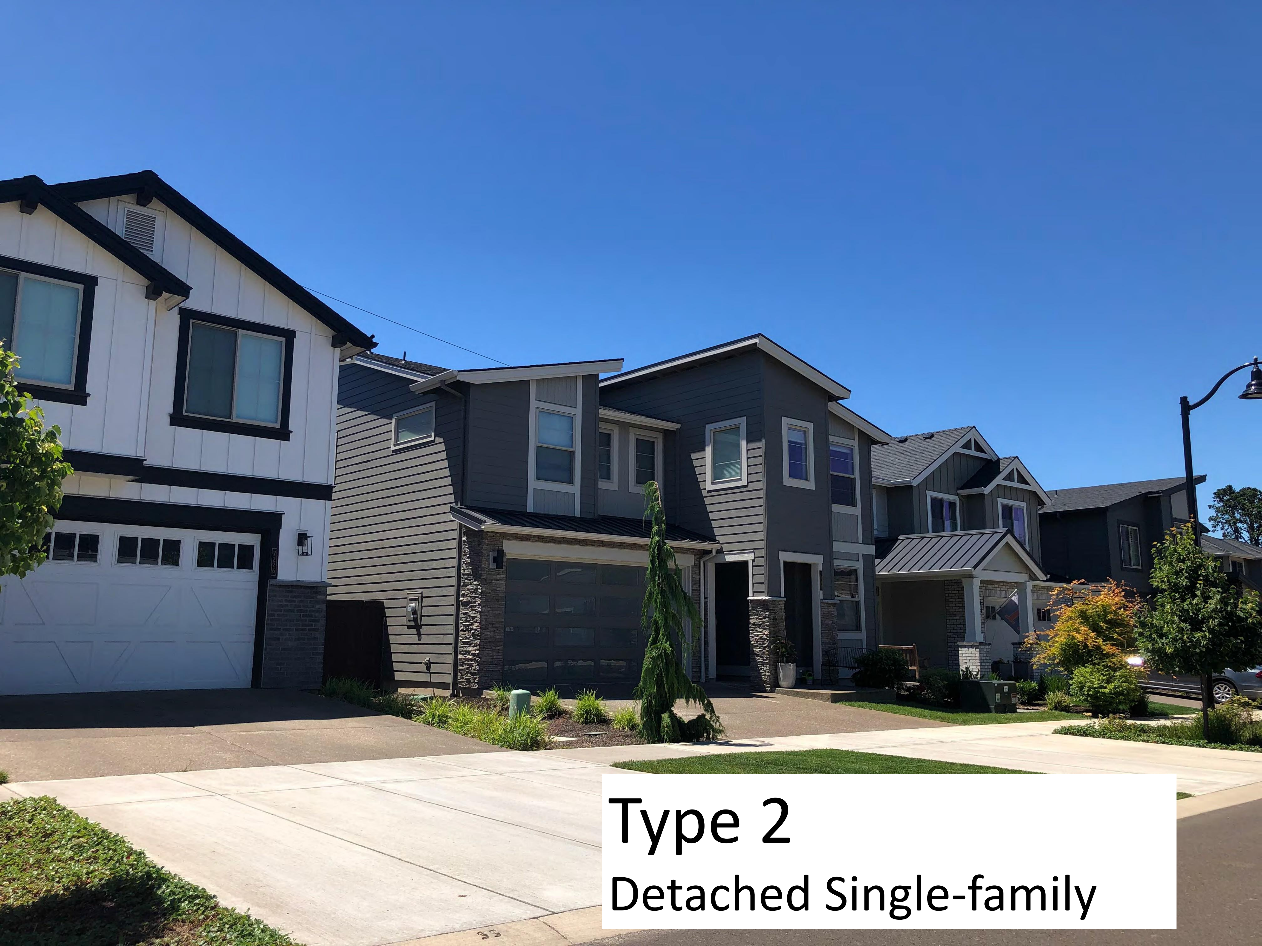
Type 2 Detached Single-family