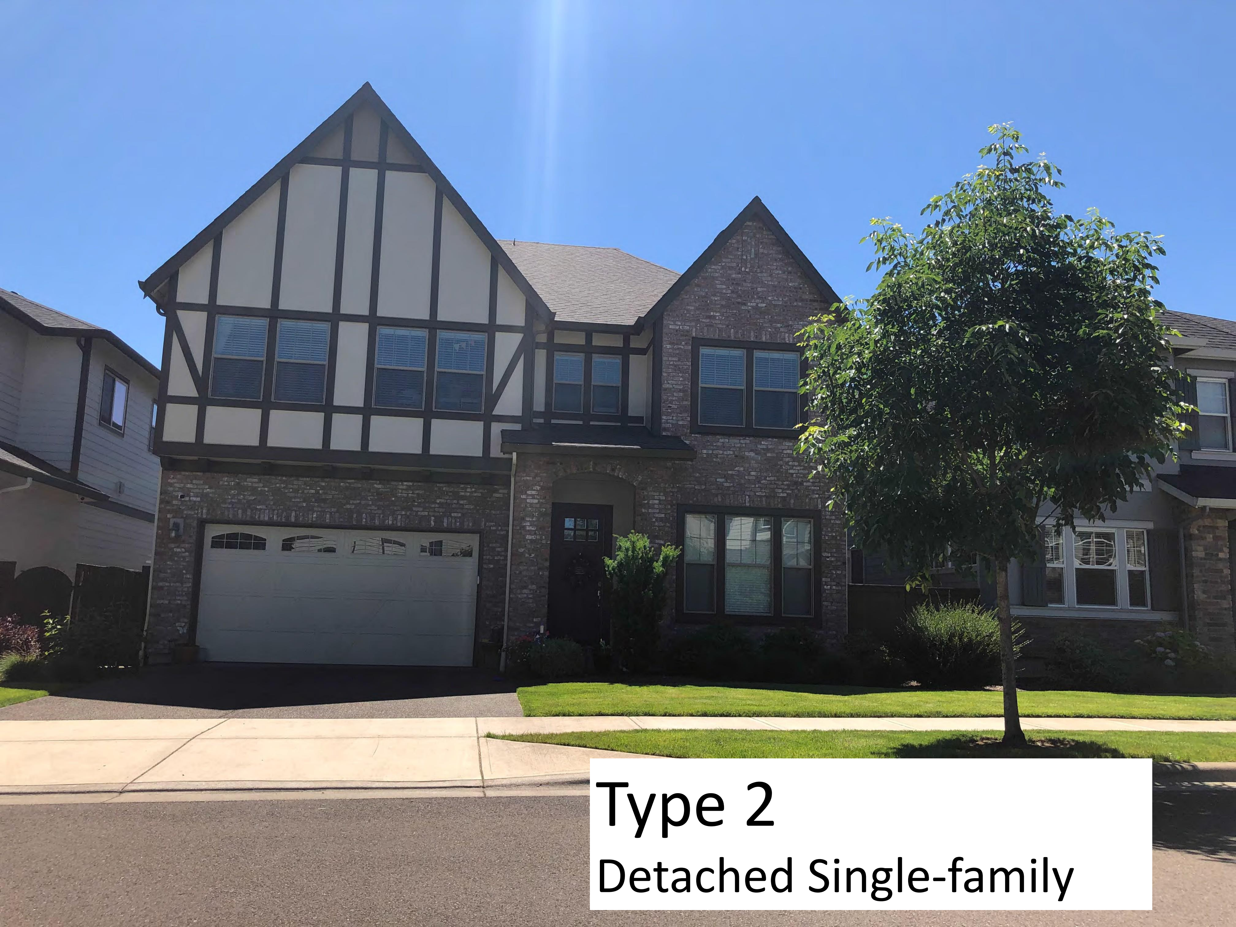
Type 2 Detached Single-family