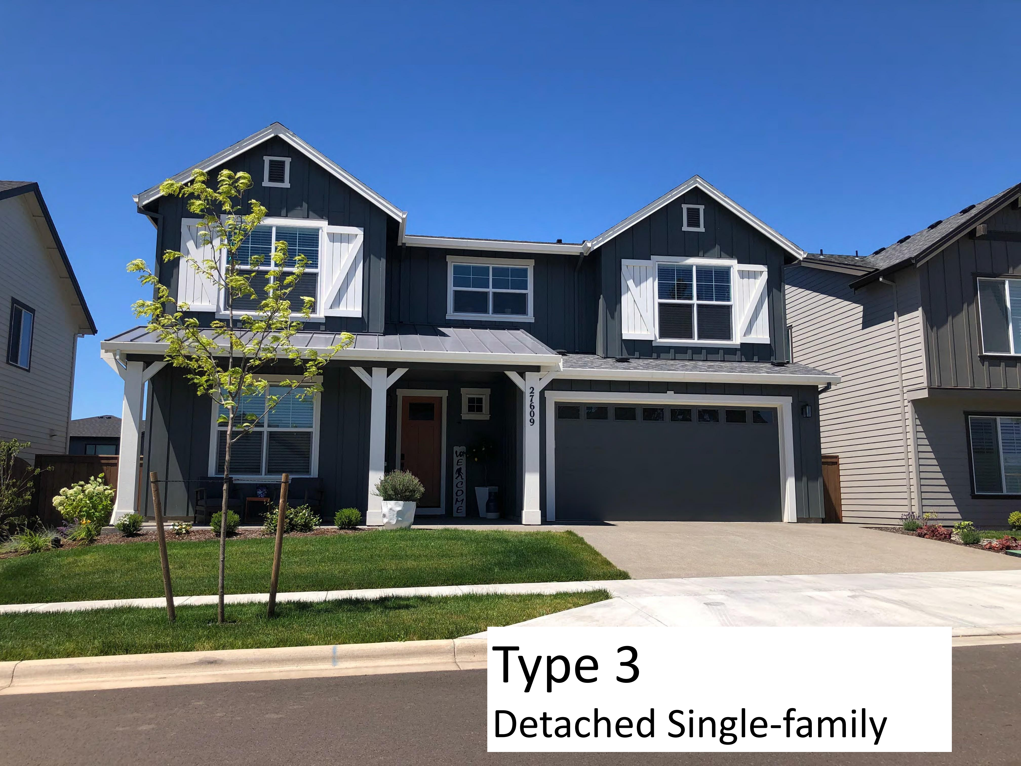
Type 3 Detached Single-family