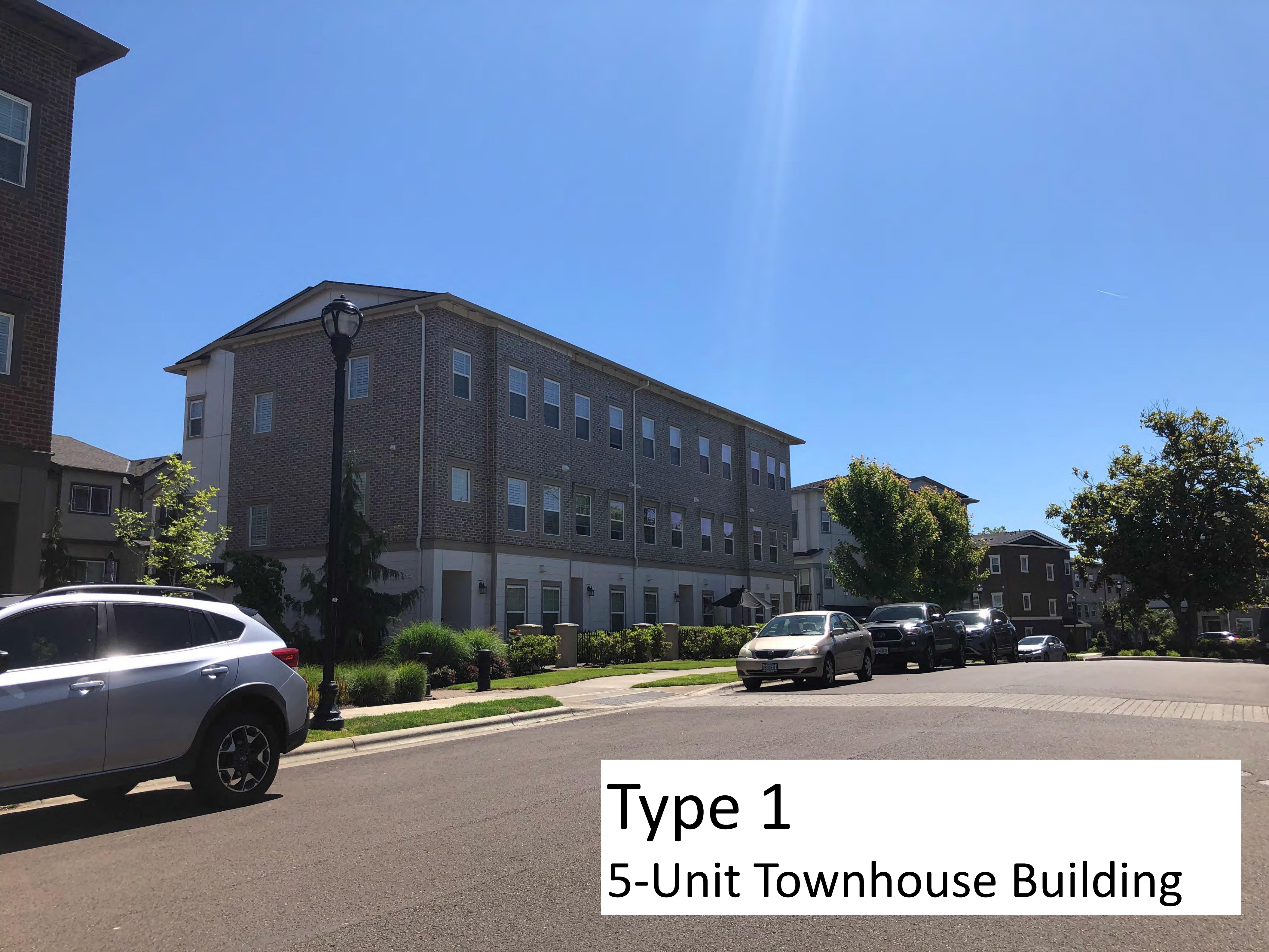
Type 1 5-Unit Townhouse Building