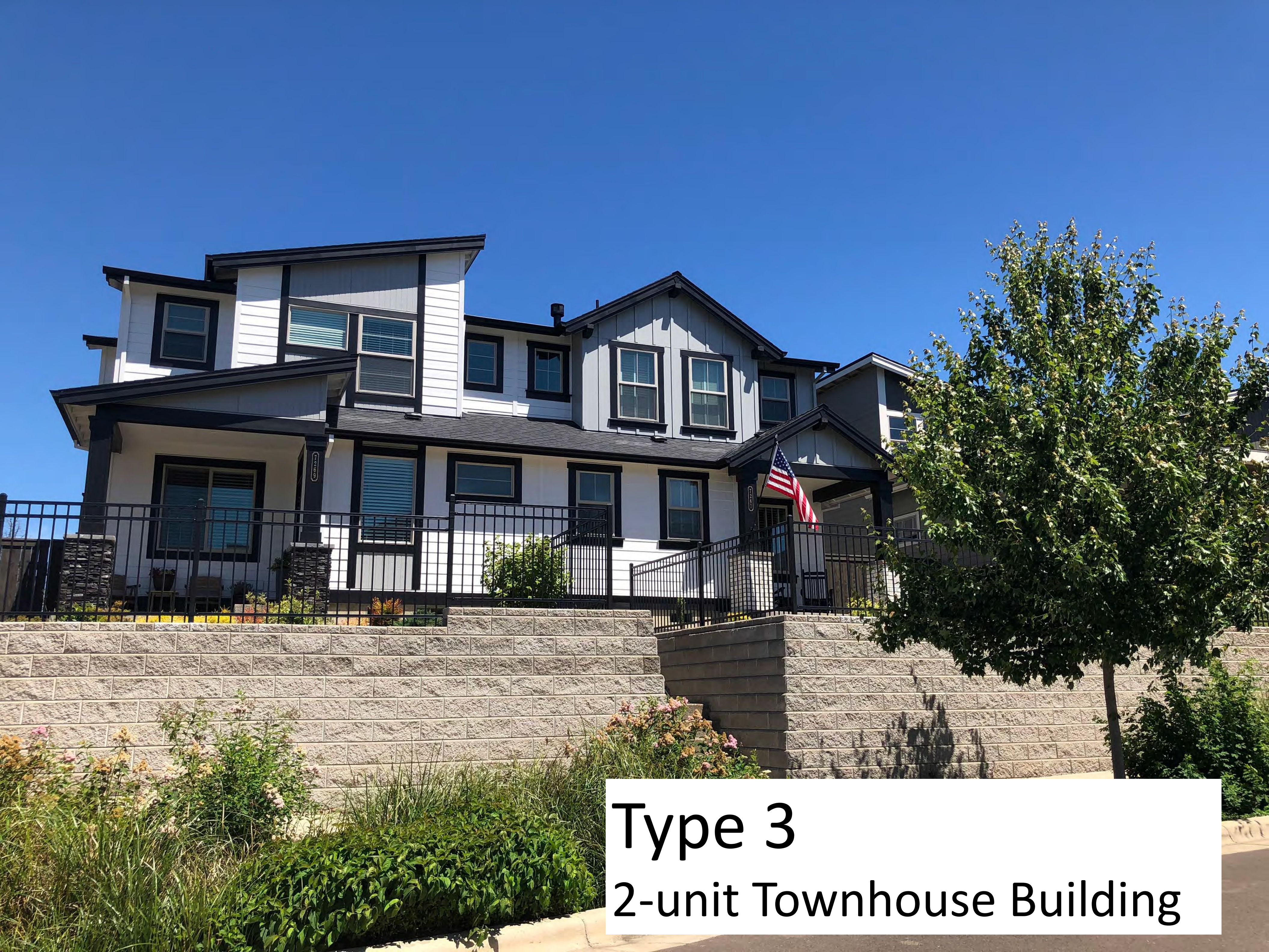
Type 3 2-unit Townhouse Building