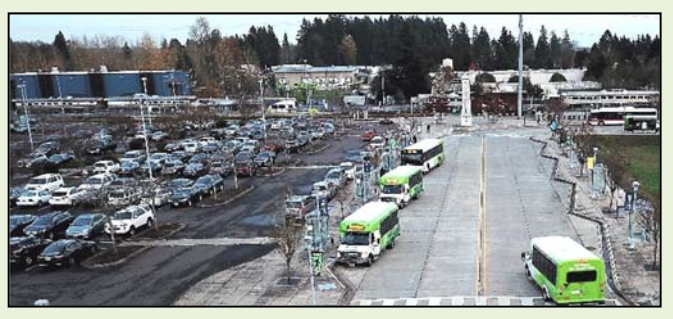
The Wilsonville SMART Transit Center serves as the TriMet Westside Express Service (WES) commuter rail train station that features a 400-car park-and-ride lot that can be expanded. Each WES train is met by SMART buses that whisk employees to the worksite within 10 minutes of arrival in Wilsonville, providing key 'last-mile' public transit service.