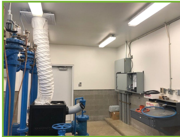
Portable A/C unit at work

Due to the extreme temperatures during the last week of the month, the Facilities staff helped set up a portable air conditioning unit to keep the Elligsen Pump House cool. The facility houses the drinking water system's radio transmitter, a vital part of our telemetry system. The telemetry system provides constant monitoring of water use data, giving technicians 'real time' status of operations and ensuring that there is enough water to meet demand.