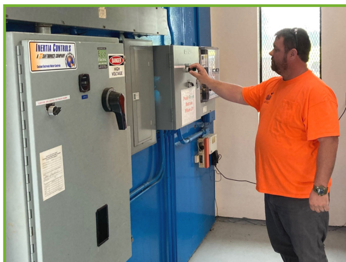
Chad operating the well

Each week a tech operates each of the City's emergency backup wells and inspects the facilities. The well is run to "waste", meaning that the water is pumped out into the storm system rather than into the distribution system. This freshens up the water and ensures that the pump and its associated components are exercised and function properly.