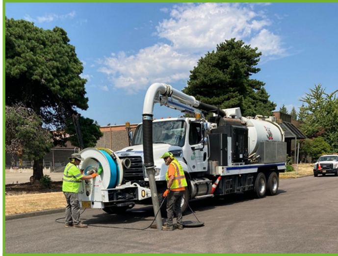
Jay & Tim cleaning a Stormwater manhole

Staff wrapped up the annual catch basin cleaning and started our yearly water quality manhole cleaning and outfall inspections. Maintenance and inspections are completed at the driest time of year with the least amount of groundwater and surface water inflow into the system.