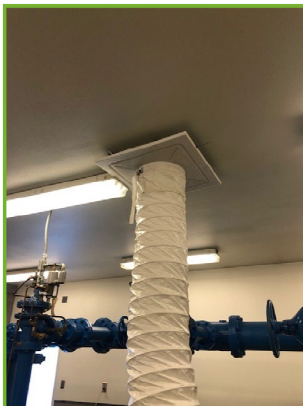
Venting the hot air

The portable unit was originally purchased as a backup cooling system for the City's server room and it came in handy to reduce the interior temperature. The hot air was forced out through the existing exhaust fan in the ceiling. The unit has a condensate tank, that, as it fills with condensation, will automatically shut down and avoid an overflow of water. It was fitted with a piece of tubing that directed the overflow into the floor drain, allowing continuous operation over the very warm weekend.