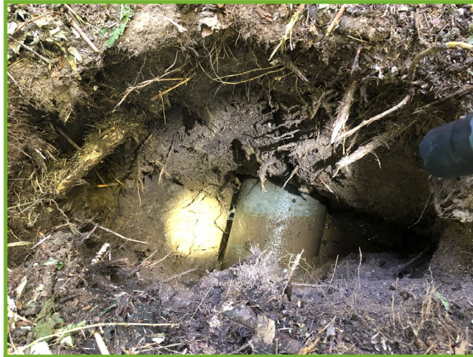
Potholing to expose pipe

Staff also assisted with potholing to gather information about the force main leaving the Charbonneau pump station. Using the combo cleaning truck, they excavate down to the pipe. The exact location is recorded as well as the depth, diameter and pipe material. This information will contribute to the design of the pump station upgrade project.