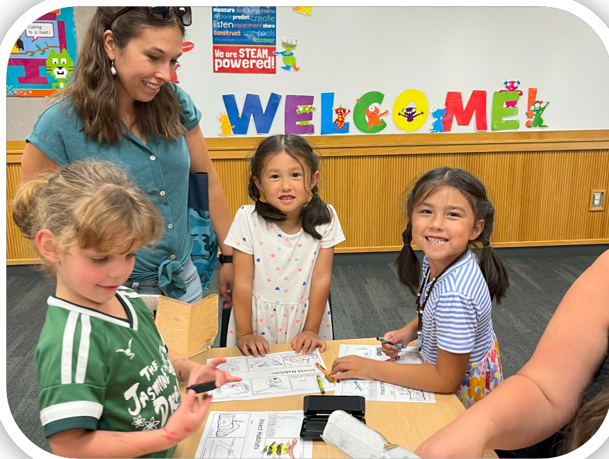
Children learned about how insects' bodies change as they grow and how they survive at an OMSI class at the library on August 2.