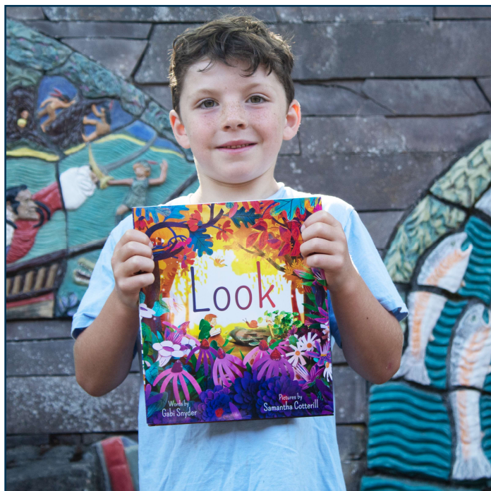
A young library patron poses with their prize from the People Are Wild StoryWalk scavenger hunt in August.