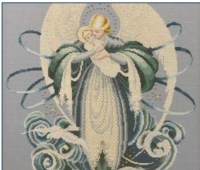
Cathy Privette's counted cross stitch artworks were featured on the library's Art Wall during August, including this angel artwork.