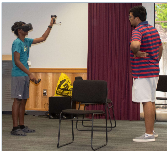
Teen Advisory Board (TAB) members test virtual reality (VR) gaming in the Oak Room at the TAB meeting on Aug. 6.