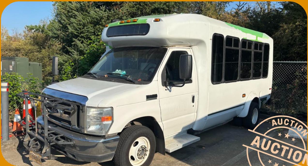
Bus prepared for surplus auction, with all city and SMART logos removed

The decision to retire them was necessary, as the high pressure fuel tanks have an expiration date, making them illegal to operate past February of 2026.