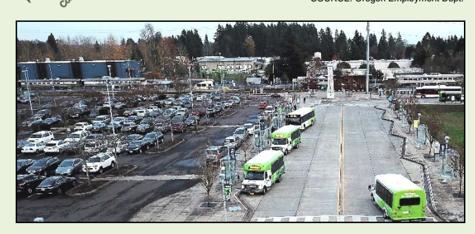
The Wilsonville SMART Transit Center serves as the TriMet Westside Express Service (WES) commuter rail train station that features a 400-car park-and-ride lot that can be expanded. Each WES train is met by SMART buses that whisk employees to the worksite within 10 minutes of arrival in Wilsonville, providing key 'last-mile' public transit service.