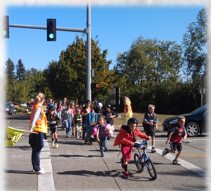
Students in crosswalk at Boeckman Creek Primary

In addition to our short list, a district-wide crossing guard program in partnership with West Linn-Wilsonville School District was in the development stages when all schools were shut down. We hope to pick up where we left off and develop active transportation clinics in partnership with WashCo Bikes.