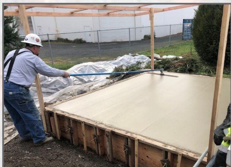
Finishing concrete for compressor installation location.

Anticipated completion date for the electric bus charging is early February. CNG station completion is scheduled for late March. Equipment lead times are slightly longer than anticipated, but the required equipment is currently in production.