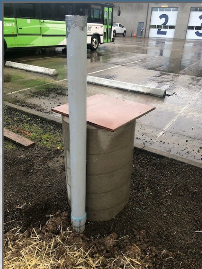
Completed fuel dispensing post support structure, awaiting hardware installation.

Complete conduit runs for both gas and electrical are installed and backfilled, and all concrete work has been completed.