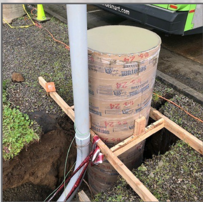
Forming and mockup of a fuel dispensing post