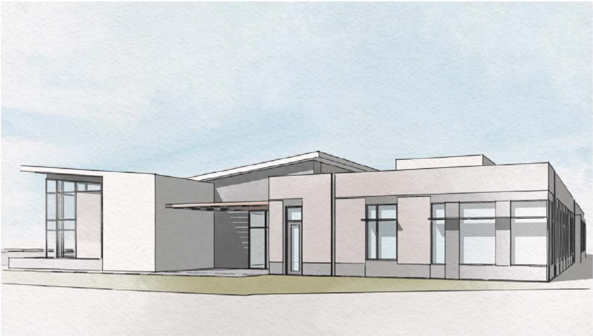
Northeast Corner View – Perspective B