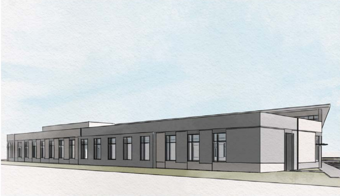
Northwest Corner View – Perspective C