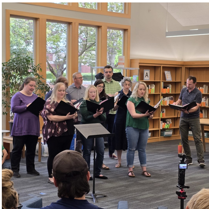
Wilsonville Choral Arts Society performs at the library on Saturday, April 20.