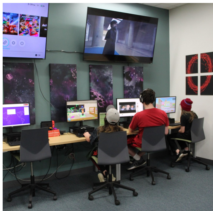
Teens play videogames and watch movies during a Teen After-School Drop-in Event.