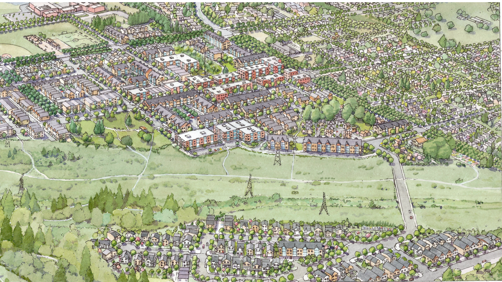
Figure 14 shows the concept of “subdistricts” within Frog Pond East and South. The subdistricts are intended as “neighborhoods within neighborhoods” – areas with cohesive building form, public realm features, and other characteristics that give them identity. There are ten subdistricts planned for Frog Pond East and South. Each will have a “green focal point” that is central in the subdistrict and/or aligned with a key feature such as a tree grove. The focal points, together with the neighborhood destinations, will provide many community gathering places in Frog Pond East and South.