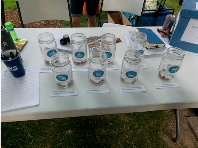
Exhibit 2. ECONorthwest staff discussing housing 1