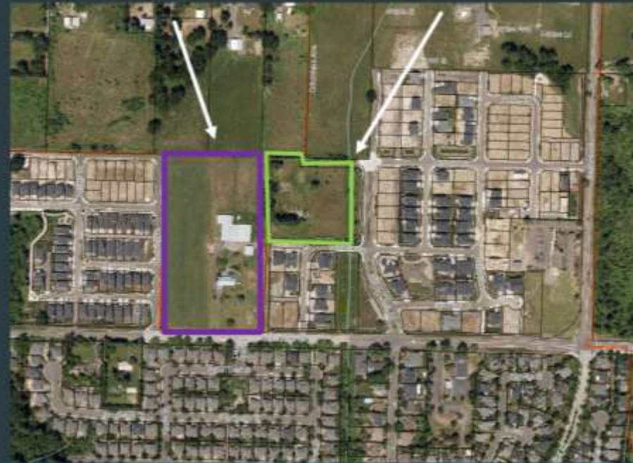
Future Primary School Site Proposed Acquisition Site