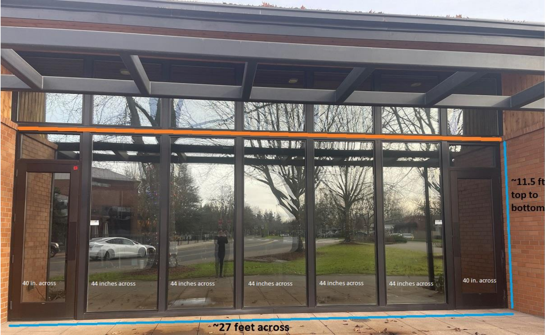
Image of Site. Mural will be on area UNDER the orange line. Windows are found at the Parks & Recreation Admin. Building 29600 Park Pl. Painting on exterior outside glass ONLY (no painting on black framing). Approx 310 Sq Ft. Measurements are not exact.