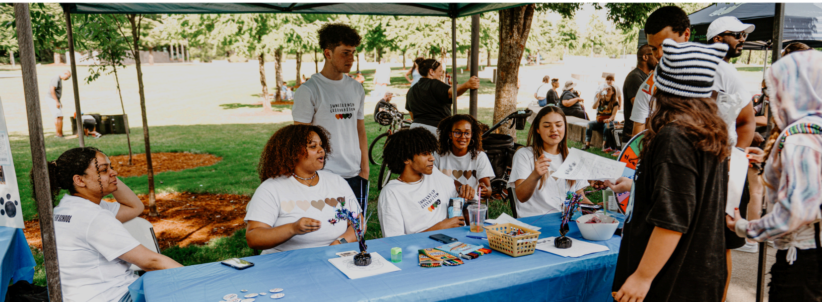
Wilsonville High’s Black Student Union at the 2024 Juneteenth Event.

We are hoping to build on this momentum, and to continue to offer free music, food and educational materials. To make this possible, we are seeking generous support from the Wilsonville community.