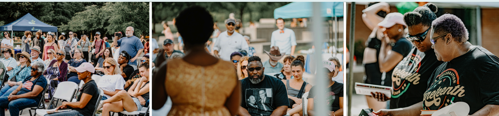
Attendees listening to 2024 Keynote address (left, middle) and enjoying book giveaways (right).