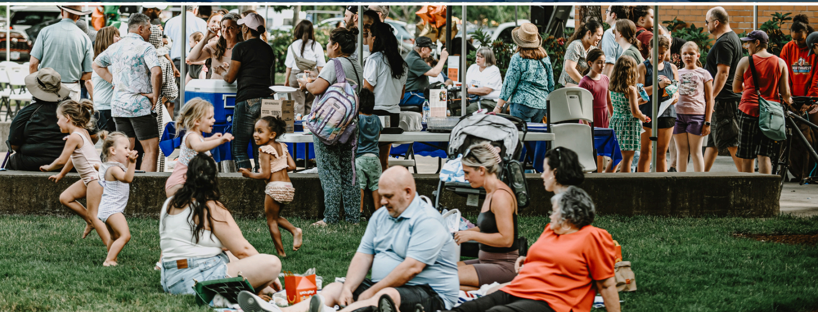
Attendees enjoying the 2024 Juneteenth Event.