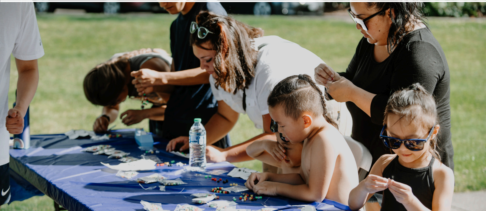
Attendees partaking in a bracelet-making activity (2024 Event).