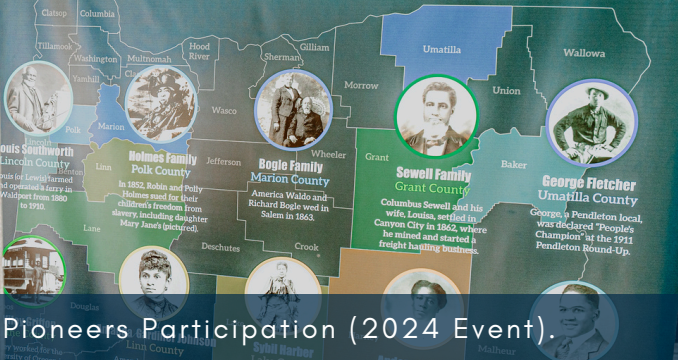
Oregon Black Pioneers Participation (2024 Event).

Oregon Black Pioneers, founded in Salem in 1993, researches, recognizes, and commemorates the culture and heritage of African Americans in Oregon. We are the only organization in Oregon dedicated to preserving and presenting the experiences of African Americans statewide. We use the term pioneers to mean not only people who moved to Oregon in covered wagons, but also people who were pioneers in their communities or professions.