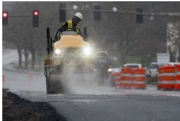
SW 95 th Avenue temporary paving