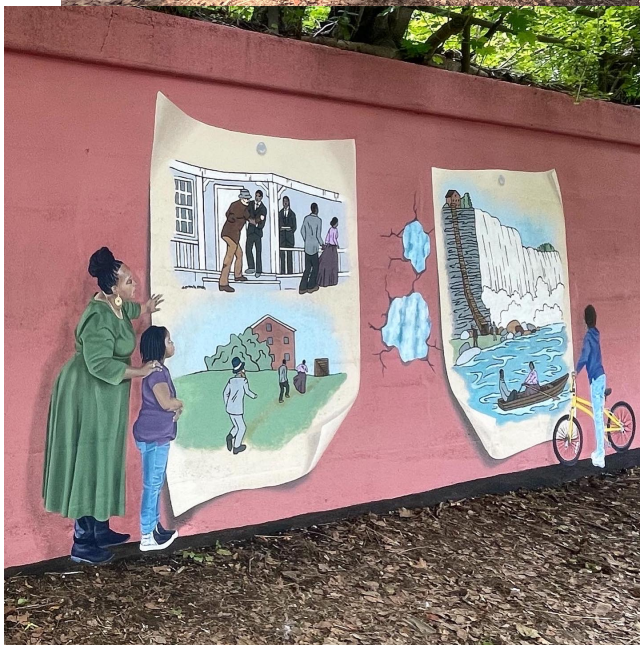
“Untold Pages of Herstory”, mural for the Niagara Falls Heritage Center (finished July 2022) 28’x15’

Painted with acrylic on site, large realistic figures were painted in studio and installed on the wall to achieve a more detailed image. Took photos of community members of Niagara Falls and recreated their images with the use of acrylic paint and realistic techniques.