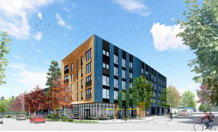
VIEW FROM SOUTHEAST CORNER