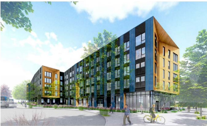
VIEW FROM NORTHWEST

Protect and Enhance City's Appeal Subsection 4.400 (.02) E. and Subsection 4.421 (.03)