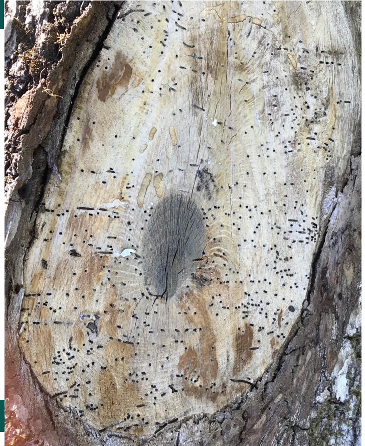
MOB Boring holes riddling an oak branch.

MOB is an ambrosia beetle. Ambrosia beetles don't feed directly on wood but inoculate the wood with symbiotic fungi and other microbes. The beetles feed on the fungal growth. Most female ambrosia beetles mate with their brothers in the host tree, therefore females leave already mated and ready to infest a new tree.