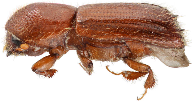
Female Mediterranean oak borer. Actual length about 1/10 th of an inch.

It is unlikely that the beetles will be seen. They are small (about 3mm long or 1/10 th of an inch), brown, cylindrical beetles. It is much more likely that their damage will be found first. The most apparent symptom are black stained galleries a little over a millimeter wide branching through oak wood (1.2-1.5mm). Trees will often be attacked at the top first, causing flagging and branch dieback. Eventually, the entire canopy may wilt and die.