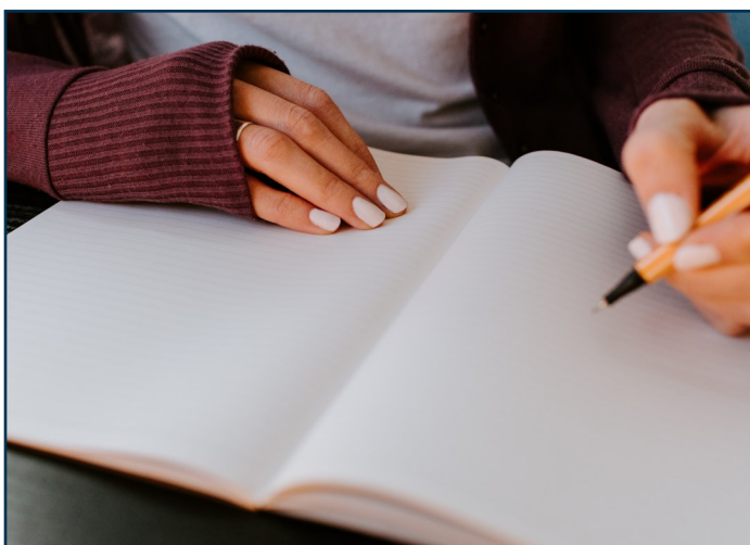
The annual Short Story Contest accepts stories of 1,500 words or less by writers of all ages, from toddlers through adults.