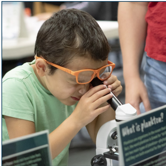
A young patron looks through a microscope at the UO Natural and Cultural History Museum's program "Journey Under the Sea" on Aug. 6.