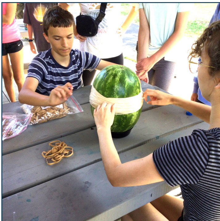
Teens wrapped rubber bands around a watermelon until it exploded at the final Teen Summer Reading Program event.