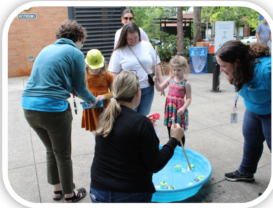
Library staff assist guests with a fishing game in front of the library booth at the City of Wilsonville's "Party in the Park" on Aug. 22.