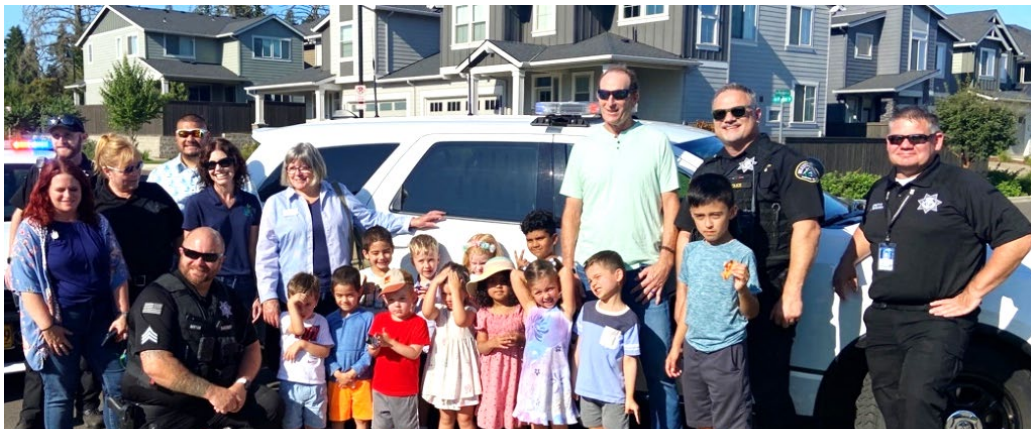
Wilsonville Police, City Staff, and BHU with community members at National Night Out. This photograph was taken at one of the Frog Pond neighborhood gatherings.