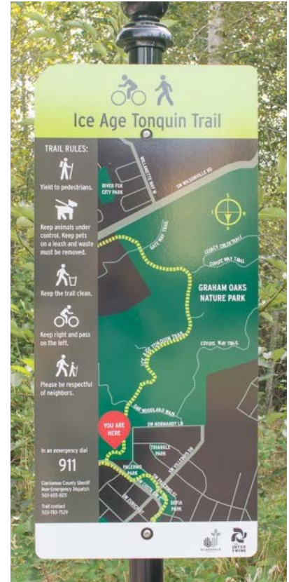
Popular Ice Age Tonquin Trail in Graham Oaks Nature Park: Villebois neighborhood entry sign, Wilsonville.

HB 2662-A was supported by the cities of Aurora, Donald, Hubbard, Keizer, Salem, Wilsonville and Woodburn; Salem Mass Transit ("Cherriots"), SMART (South Metro Area Regional Transit) and Yamhill County Transit; and P & W Railroad. WES sponsor, TriMet, was neutral on the bill.