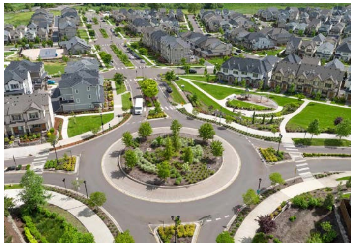
Wilsonville’s Villebois “urban village” development: Extensive infrastructure—including water, sewer, storm-water, roads, sidewalks, parks and other amenities—were funded with a combination of urban renewal (tax increment financing) and system development charges.

Unfortunately the Governor’s Housing Production Advisory Council has no representatives of cities that provide the planning and infrastructure that support the development of new homes. The Governor’s Office has relied on real-estate interests advocating for simplistic solutions that upend local standards and just add new undeveloped land to cities’ Urban Growth Boundaries that does