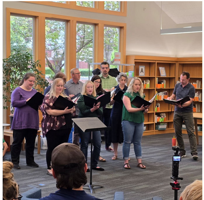
Wilsonville Choral Arts Society performs at the library on Saturday, April 20.