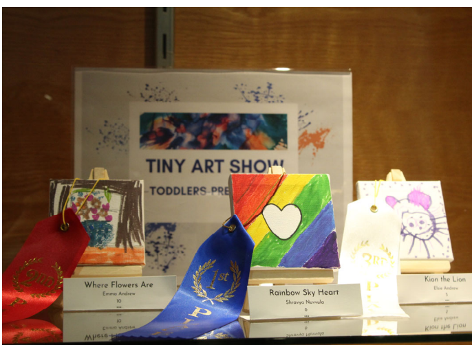
Winners of the Toddler-Preschool category in the Tiny Art Show on display in the library lobby throughout April.