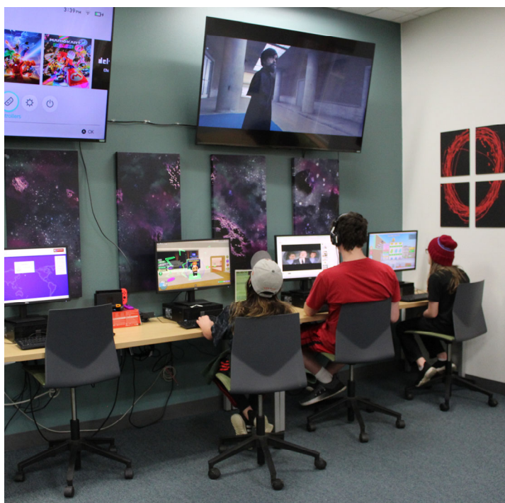
Teens play videogames and watch movies during a Teen After-School Drop-in Event.