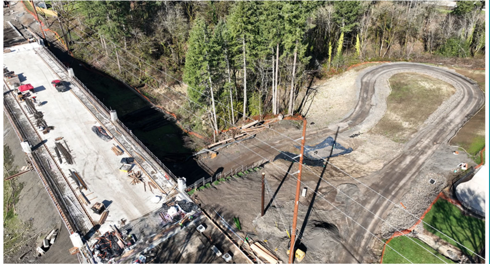
The start of the Boeckman Trail with the bridge with light pillars installed.

The entire project is expected to be complete in fall 2025.