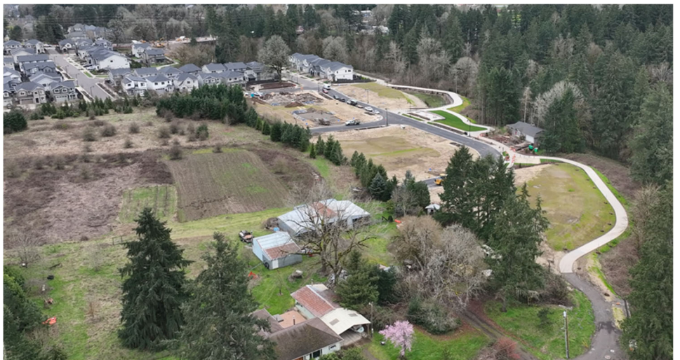
Improvements on the right side of the picture are from the Frog Pond Terrace subdivision. The undeveloped property on the left side of the picture will be the Frog Pond Ridgecrest subdivision.