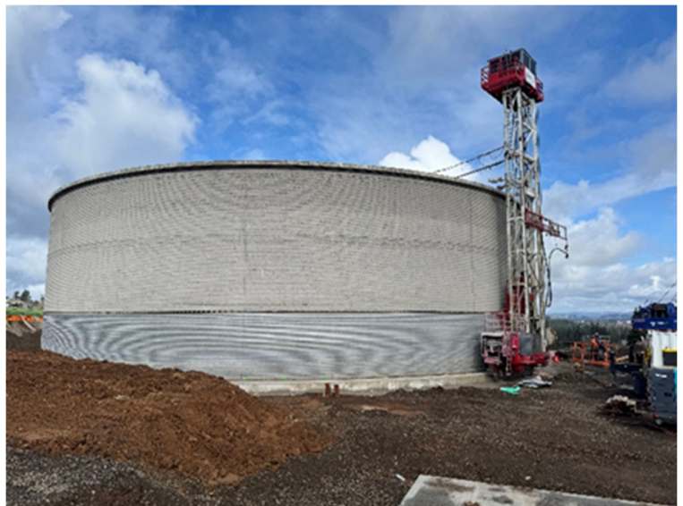
Concrete tank pre-stressing

Commissioning of the new reservoir is scheduled for late spring of 2025.