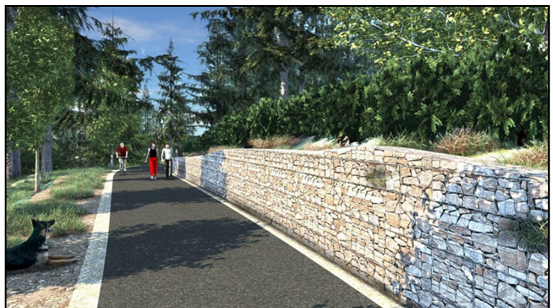
Rendering of the trail and sanitary sewer maintenance path.

Investigative work on the west side of the Wilsonville Bridge at Boeckman Creek is completed. Preliminary design iterations are complete, and several workable solutions have been identified to meet all project needs. A public open house was held on September 11 to seek input on the design to refine the layout. Results of the feedback were generally positive. Geotechnical drilling and other field investigations were completed in January and resumed in March due to weather. 30% plans are currently under review.