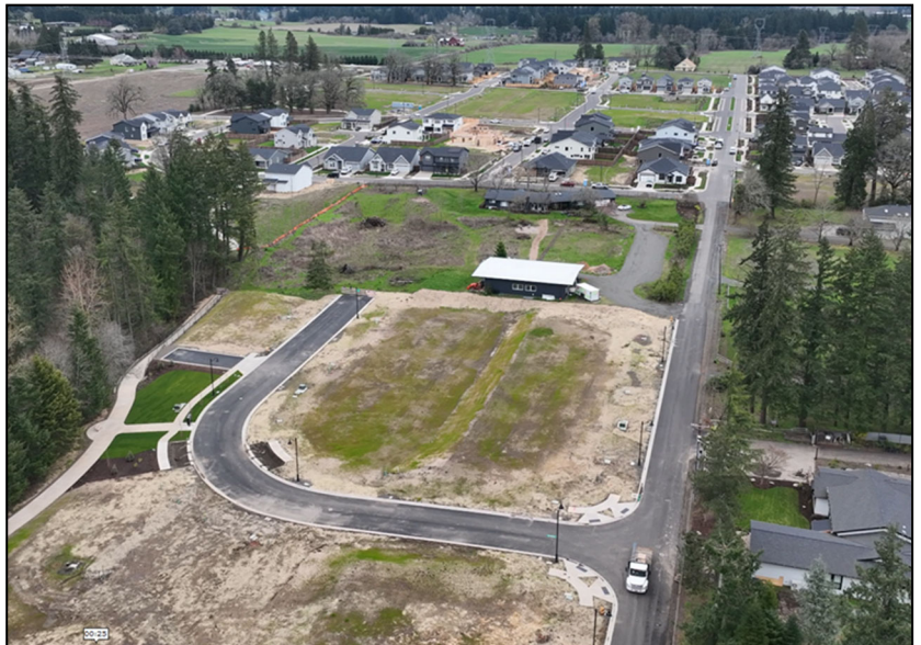
Looking east from Boeckman Creek toward Stafford Road. Frog Pond Overlook is in the forefront, Frog Pond Vista, Oaks and Crossing are further east.