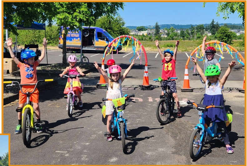
Bike Rodeo Participants

SMART staff kicked June off with two Bike Rodeos: the first on June 2 at Wilsonville Transit Center and the second on June 3 at Meridian Creek Middle School. We provided helmet adjustments and hosted a bike repair mechanic to provide free minor bike repairs to participants and community members. Attendees with no bicycle were welcome to use one of the bicycles borrowed from the City of Tigard. Helmets were provided by SMART, free of charge to keep for those in need.