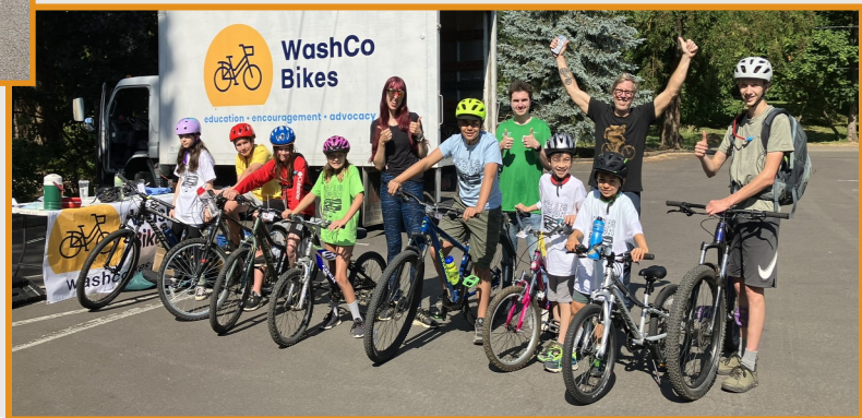
Bike Adventure Camp 2023

A deputy from Clackamas County Sheriff’s Office and firefighters with TVF&R joined the event at Meridian Creek Middle School and helped guide kids through the agility course. Attendees also had the opportunity to visit the police vehicle and the fire truck. The event was featured on the Wilsonville Spokesman .