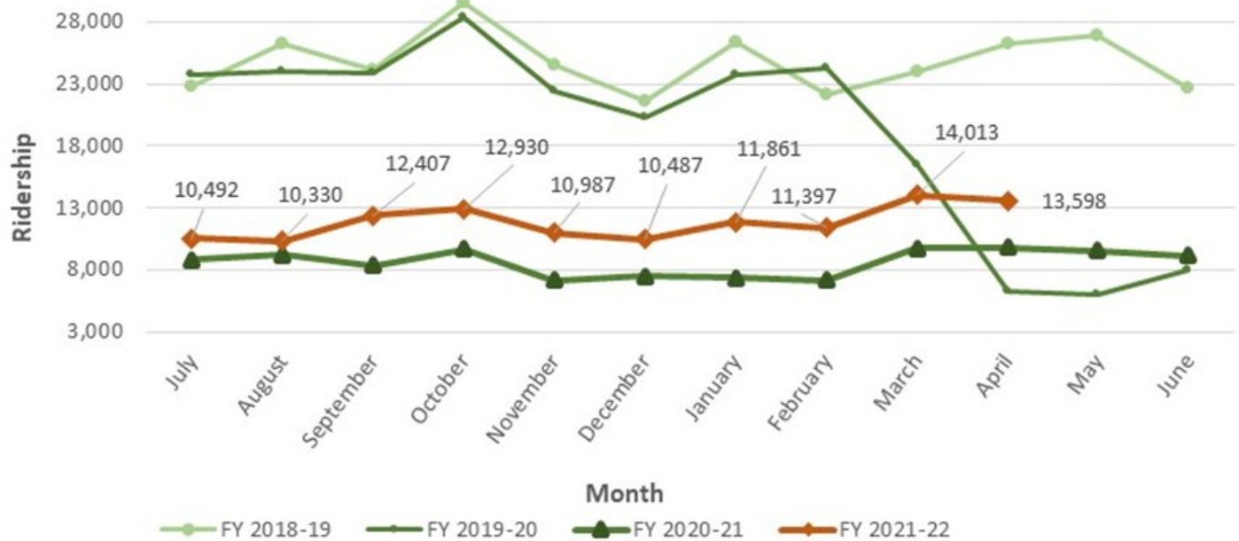
Fixed Route Ridership Trends by Month