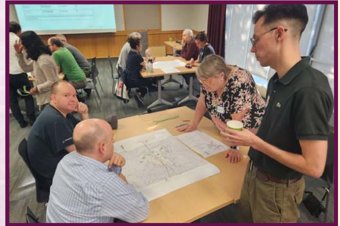
Participants configure bus routes

projects to further our continued efforts to transition to alternative fuels.