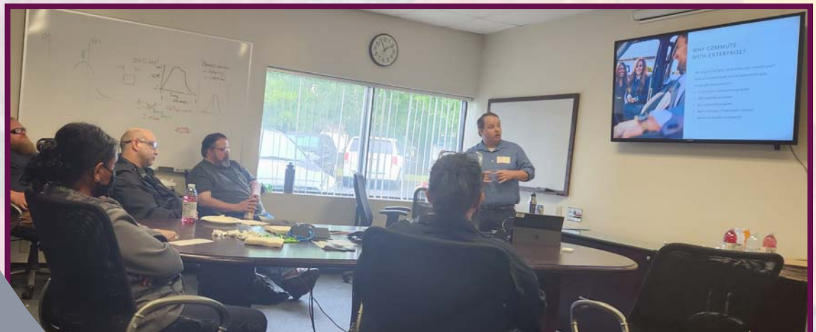
Vanpool information session at OptiMIM