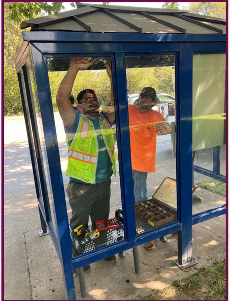
City of Wilsonville employees replace glass panel

Glass replacement work is handled in house, which allows for very prompt repairs.