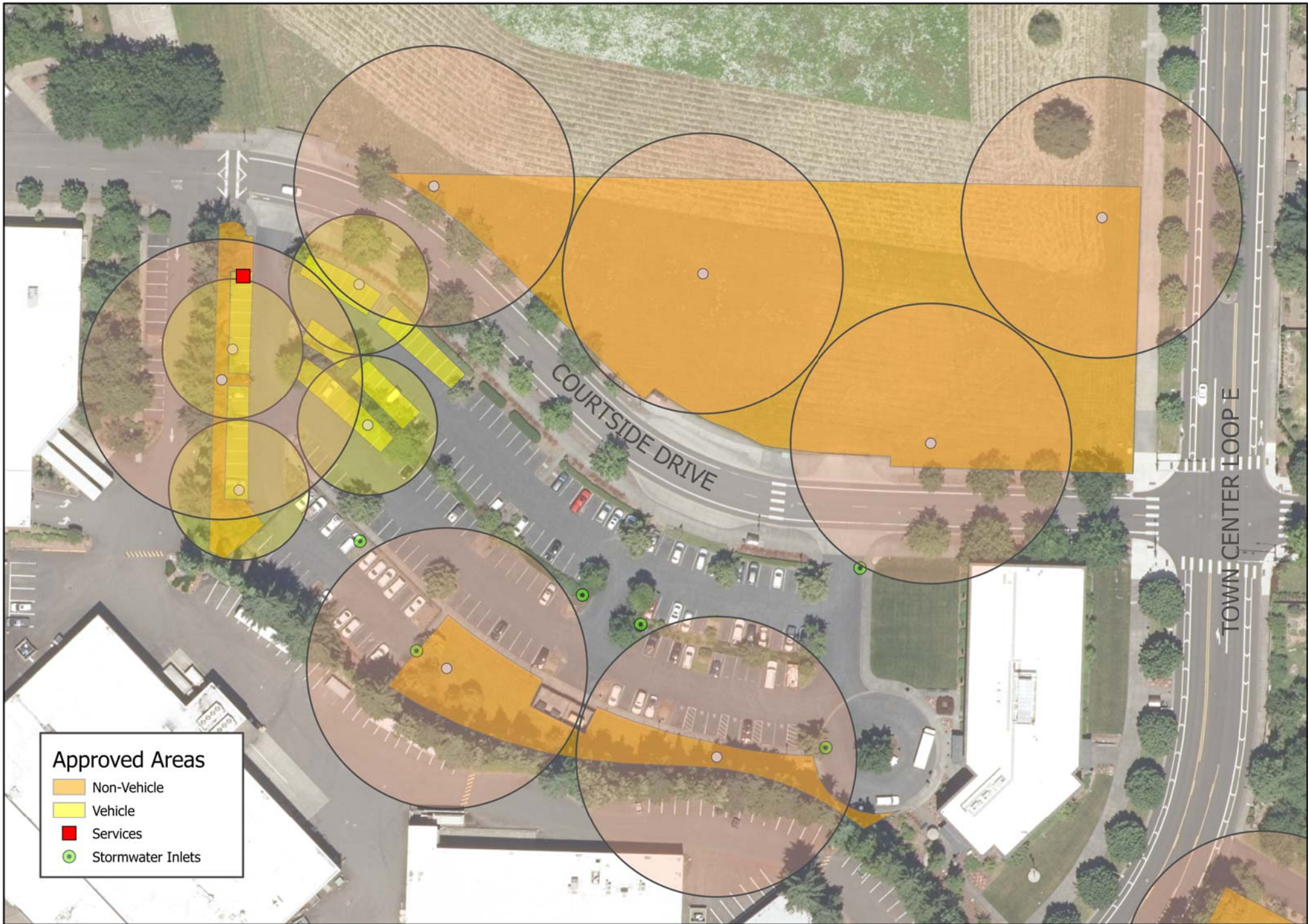
ATTACHMENT F - 200 FT CENTERS