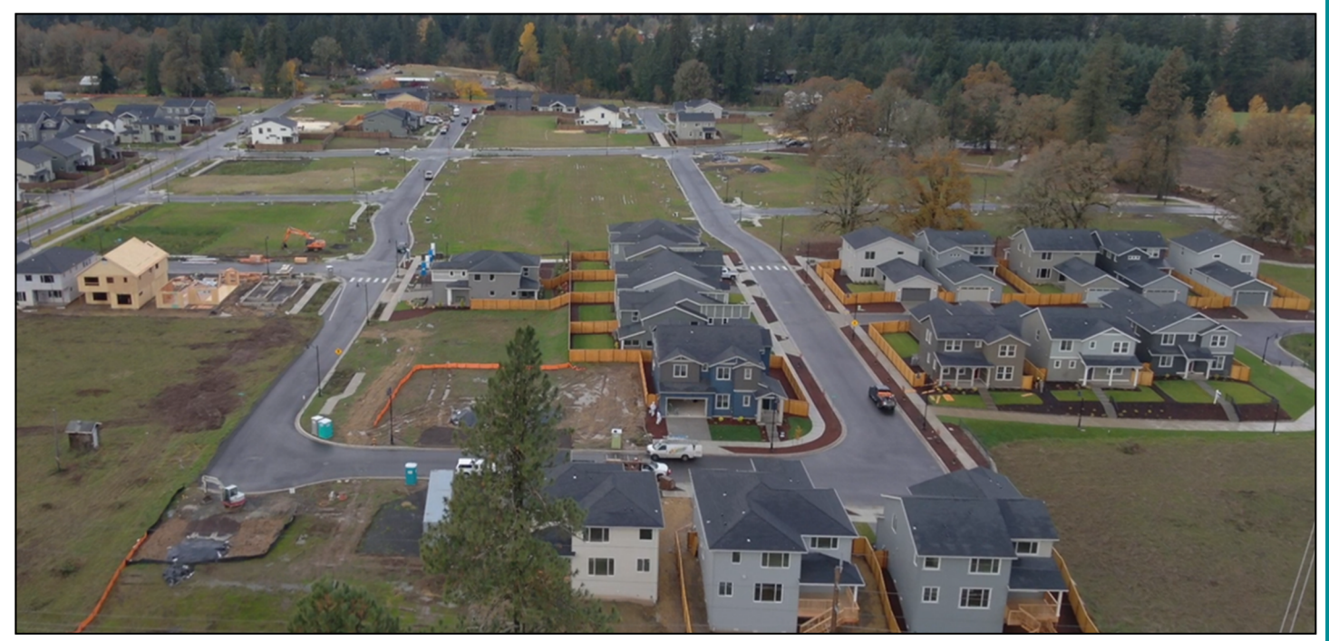
Photo taken from Stafford Road looking west over Frog Pond Crossing, Frog Pond Oaks and Frog Pond Vista