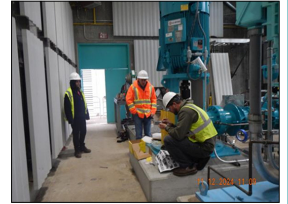
Inspection and testing a new finished water pump at WTP

Ongoing coordination efforts continue with the Willamette Water Supply Program (WWSP). Here are the updates on major elements within Wilsonville: