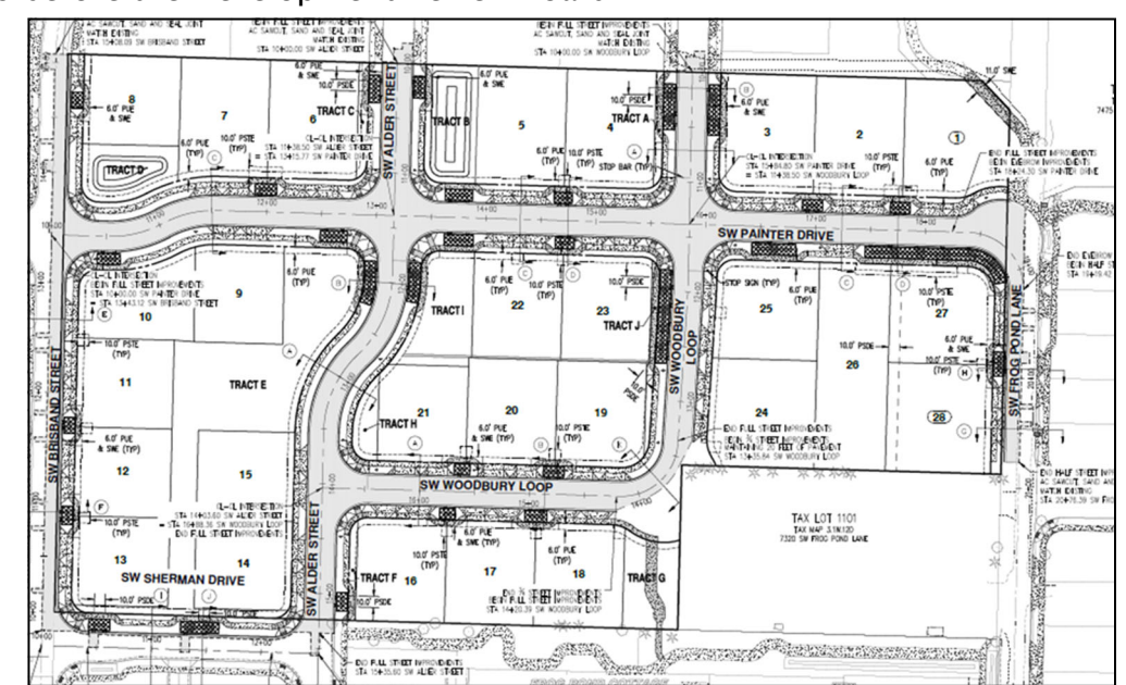
Proposed Layout of Ridgecrest Subdivision in Frog Pond West