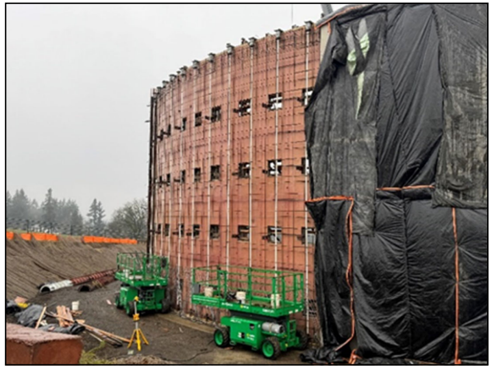
Reservoir wall forms prior to pour.

Construction of the reservoir walls is 50% complete, with final wall completion expected in January 2025 Tank construction is expected to be completed in March. Commissioning of the new reservoir is scheduled for spring of 2025.