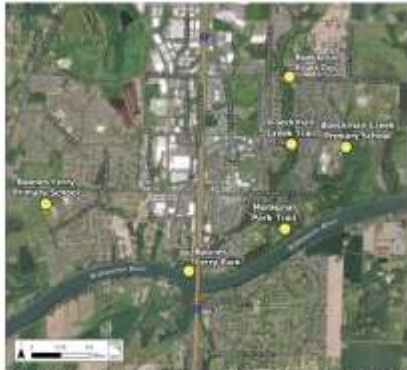
Map showing the locations of the 6 active cameras under the Community Wildlife Connection project: Bowen Ferry Primary School, Bowen Ferry Park, Memorial Park Trail, Boeckman Creek Trail, Boeckman Road "Dip", and Boeckman Creek Primary School.

Six monitoring areas were selected by the City of Wilsonville and communicated to Seneca Group at the start of the project. Prior to monitoring, each location was investigated for ideal camera placement that took into account presence of an existing game trail, viewshed, and likelihood of vandalism or theft. After these locations were identified, cameras were installed beginning August 17, 2023.