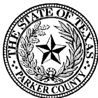
EXHIBIT A: ELECTION DATE AND TIMES