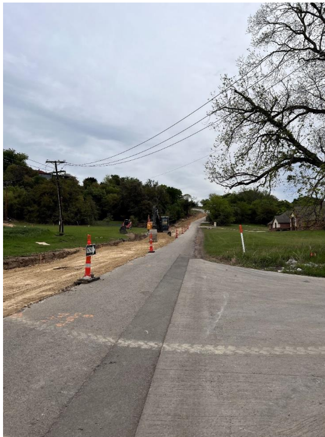
King's Gate Road looking north