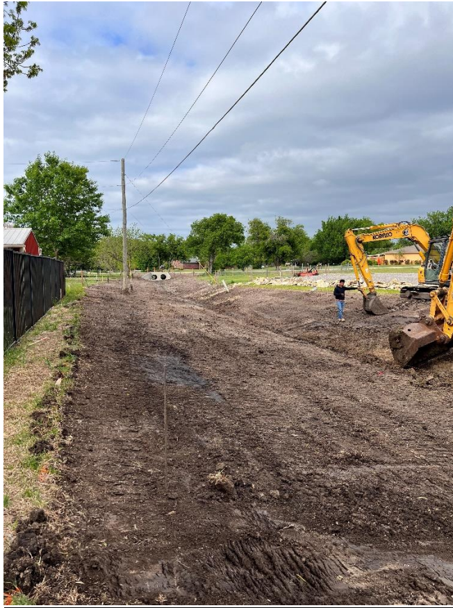
Channel B looking west