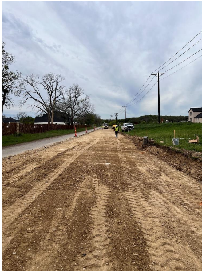
King's Gate Road looking south