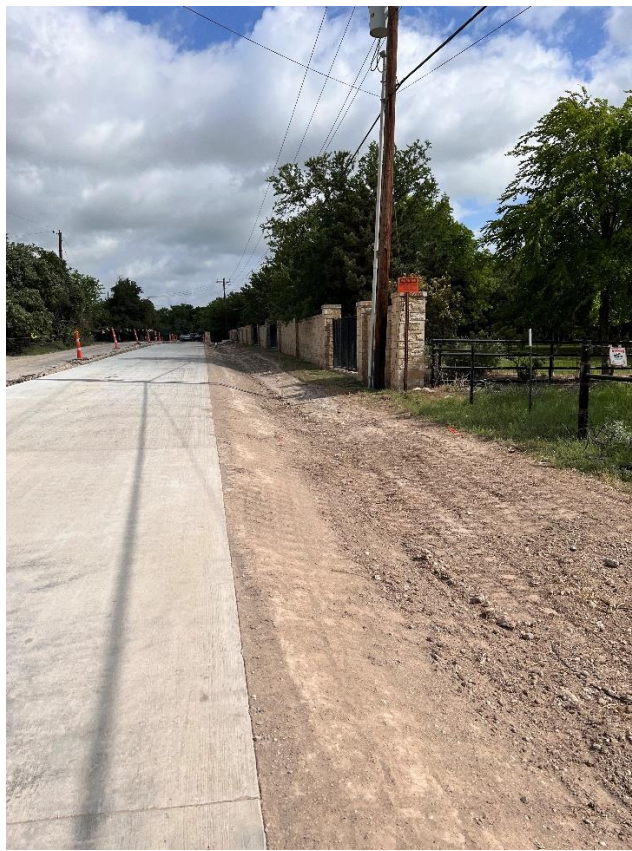
Crown Road looking north