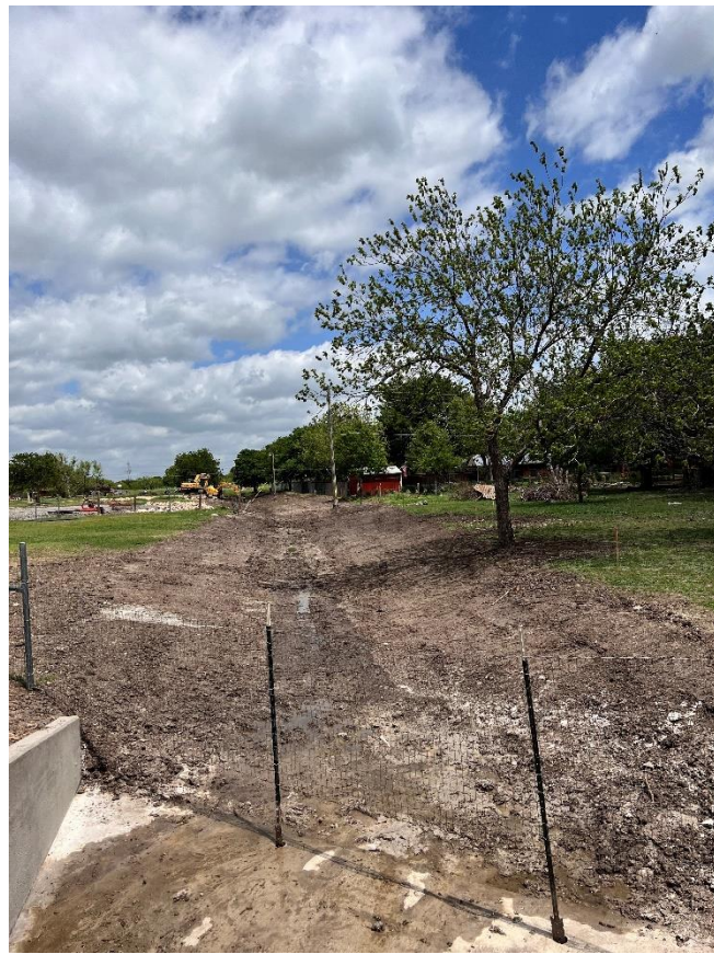
Channel B looking east