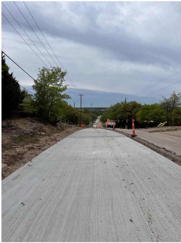
Crown Road looking south