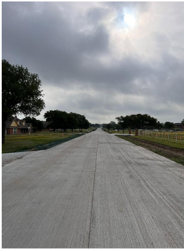
Sam Bass Road looking east