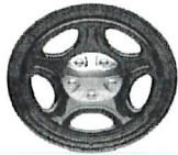
STANDARD PIU WHEEL