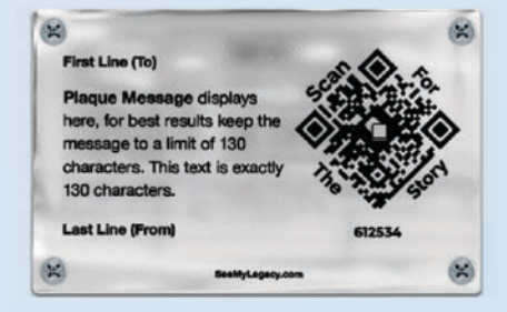
Story Dedications Starting at $84